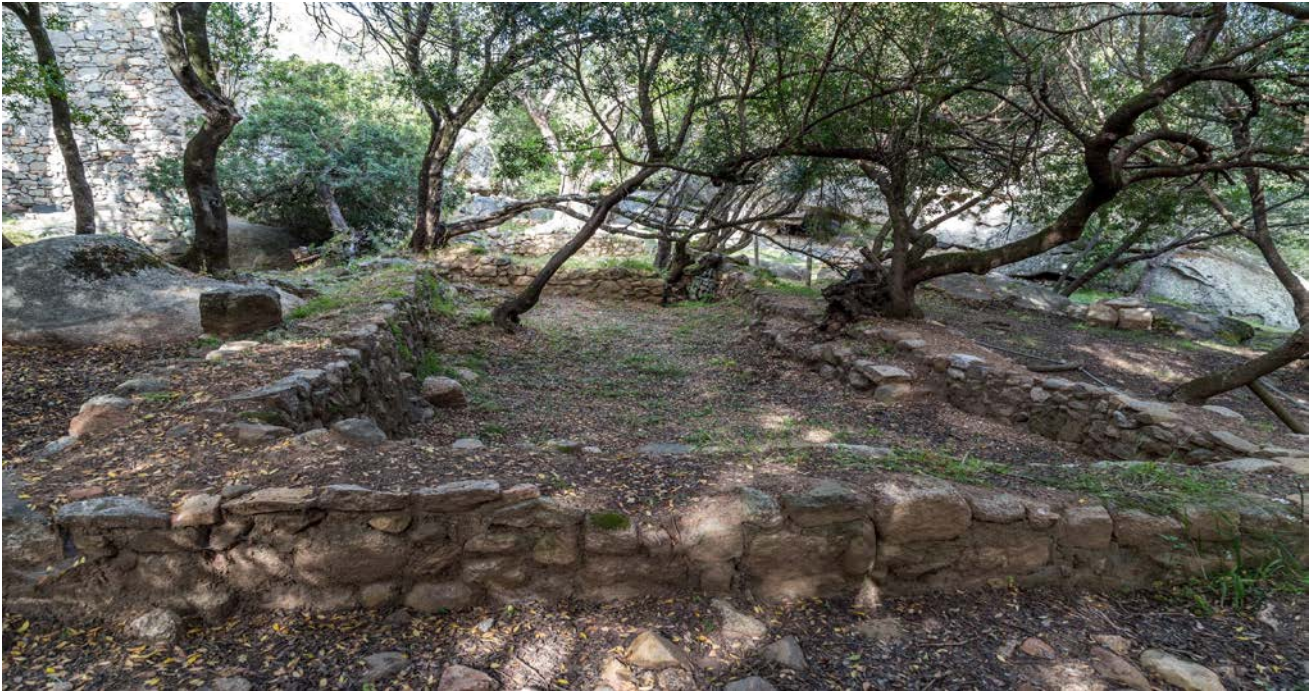
Fig. 3 - The Palace of Baldu, room κ, seen from the West.

It has been hypothesised that the rooms had different uses, such as housing and workshop: the latter was found in rooms beta ( \beta ) and gamma ( \gamma ), where numerous metal artefacts were unearthed; other rooms must have been used as warehouses, kitchens, stables and workshops. These activities, together with the presence of the tower, allowed identification of the settlement as an important administration centre for the Giudicato di Gallura, or, as the residence of one of the political and religious subjects, who played a decisive role in controlling the kingdom. In room iota ( \iota ) a well with fragments of an Islamic jar - perhaps used for storing water or food - and traces of a fireplace were found.