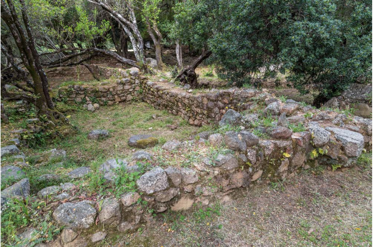
Fig. 2 - The Palace of Baldu, rooms \iota and \kappa , view from the East.

It was also possible to recognise a particular building pattern, called "double room", which involves joining two spaces (one larger and one smaller one) through one access: this happens in the case of kappa ( \kappa ) and iota ( \iota ), (figs. 2-3); pi ( \pi ) and alfa ( \alpha ); csi ( \xi ) and ni ( \nu ).