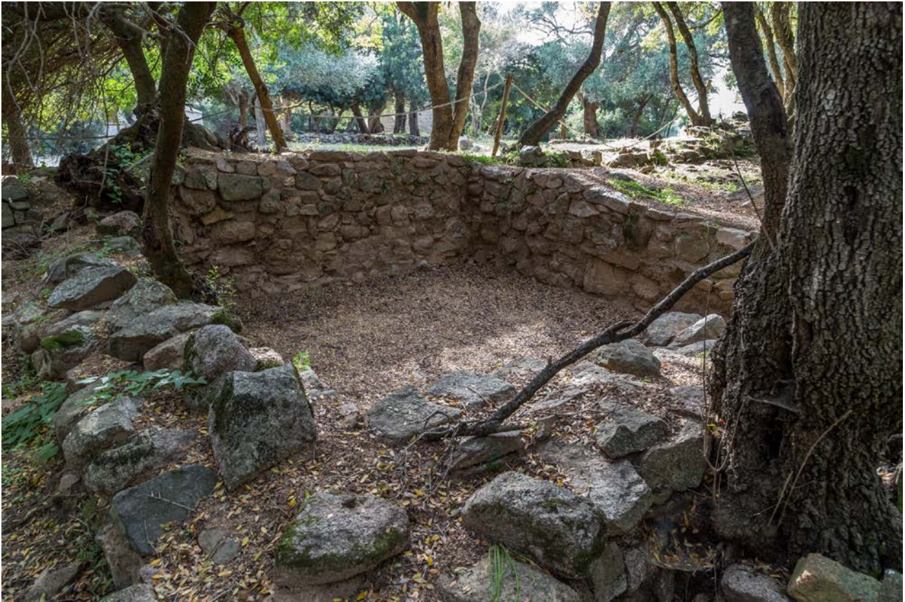
Fig. 2 - Luogosanto, Palazzo di Baldu: il vano v, indagato nella campagna di scavo 2014.

The rooms also have different types of floor, sometimes simple beaten clay, others more complex and layered, as seen in rooms kappa ( \kappa ) and iota ( \iota ). A crawl space was found in the former, made of medium and large stones, arranged that were connected with mud mortar mixed with fragments of bricks and limestone; finally a layer of smooth mortar to make the floor even; this would be a method used at least until the beginning of the last century, called " Lu pamentu " (fig. 3) and can still be found in local stazzi. A similar floor technique using flattened mud mortar, smoothed and left to harden, can be found in southern Sardinia, with the variation of the name Su Pamentu .