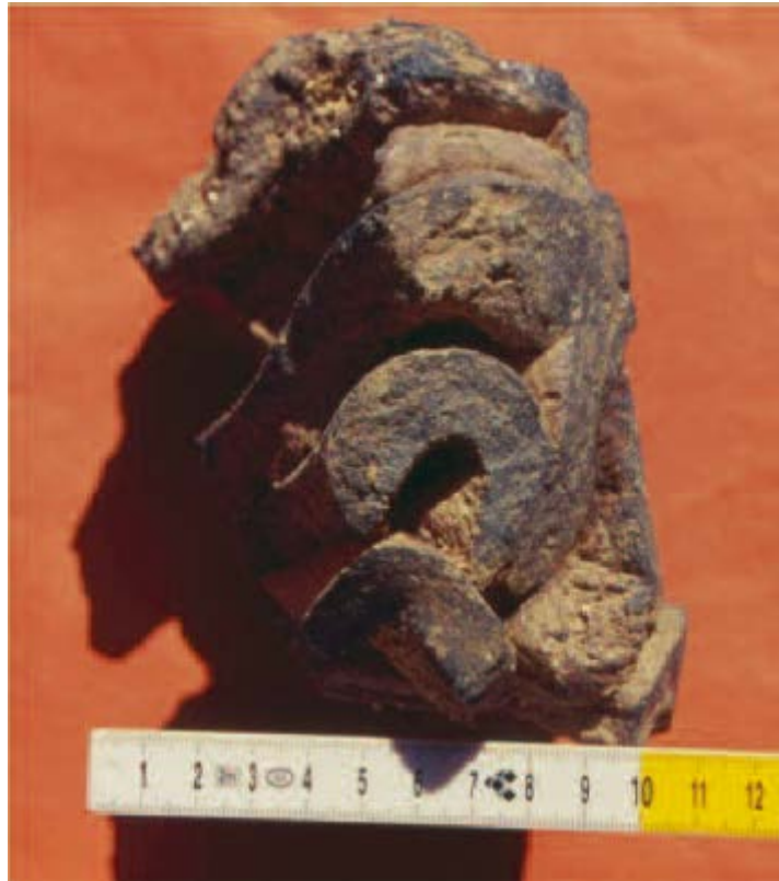
Fig. 4 - Luogosanto, Palace of Baldu: warped bricks melted together during firing (From Pinna, Corda a c.d.s., p. 152 fig. 10).