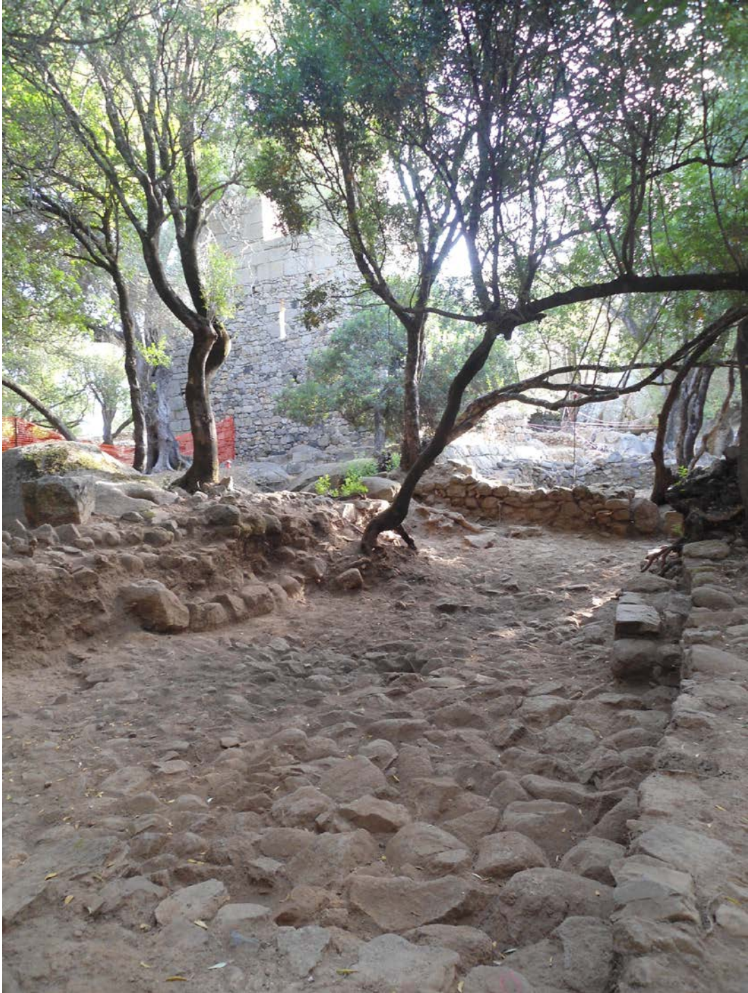
Fig. 3 - Luogosanto, Palazzo di Baldu: lu pamentu found in room κ during the archaeological digs.

The roofs over the rooms comprised round and square tiles, found during the digs, due to the collapse of the walls. The same tiles were made in a nearby kiln, near to which process waste was found (fig. 4).