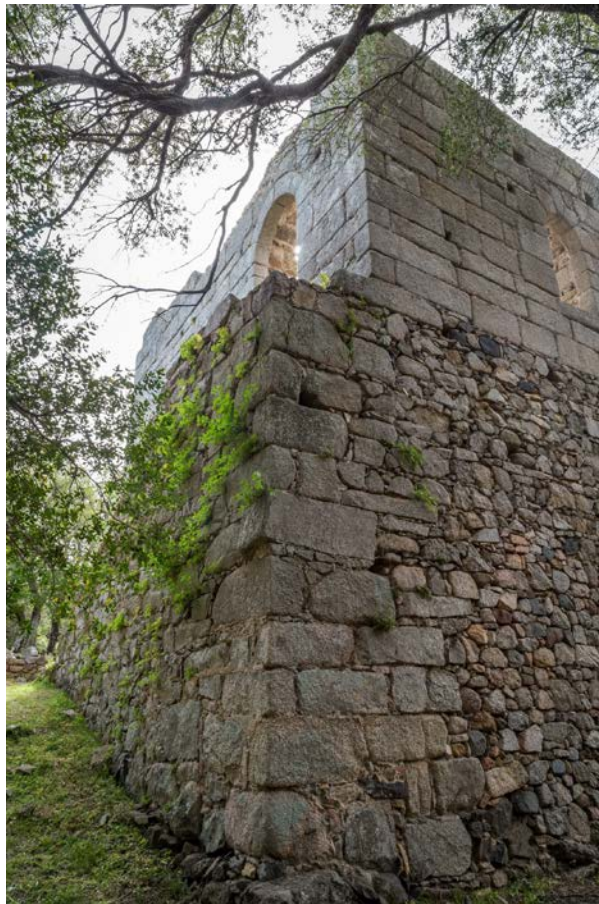
Fig. 1 - Luogosanto, Palace of Baldu: corner between the North and West façades.

The tower shows different building techniques: a clear distinction can be seen between the lower and top parts of the structure (fig. 1).