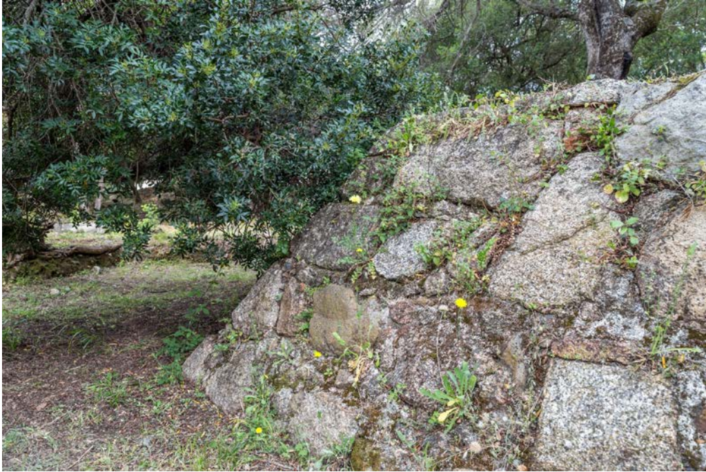
Fig. 5 - Luogosanto, Palazzo di Baldu: scarp base to bottom of tower wall.