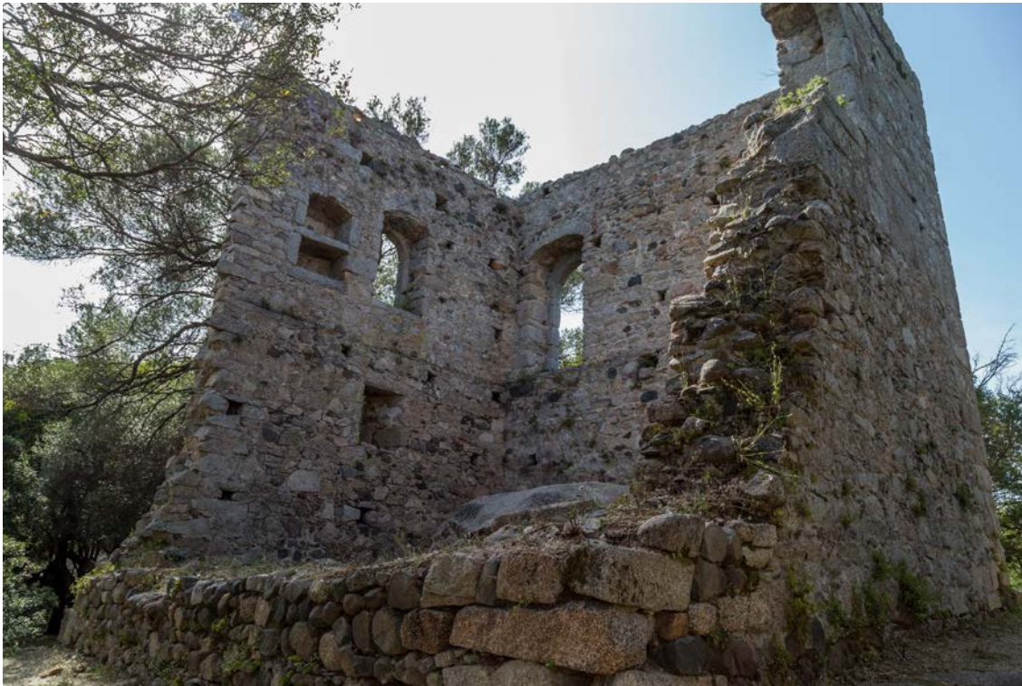
Fig. 2 - Luogosanto, Palace of Baldu, seen from the South-East.

been a storeroom. The first floor received air and light from embrasures while the second floor had single-arch windows (fig.2).