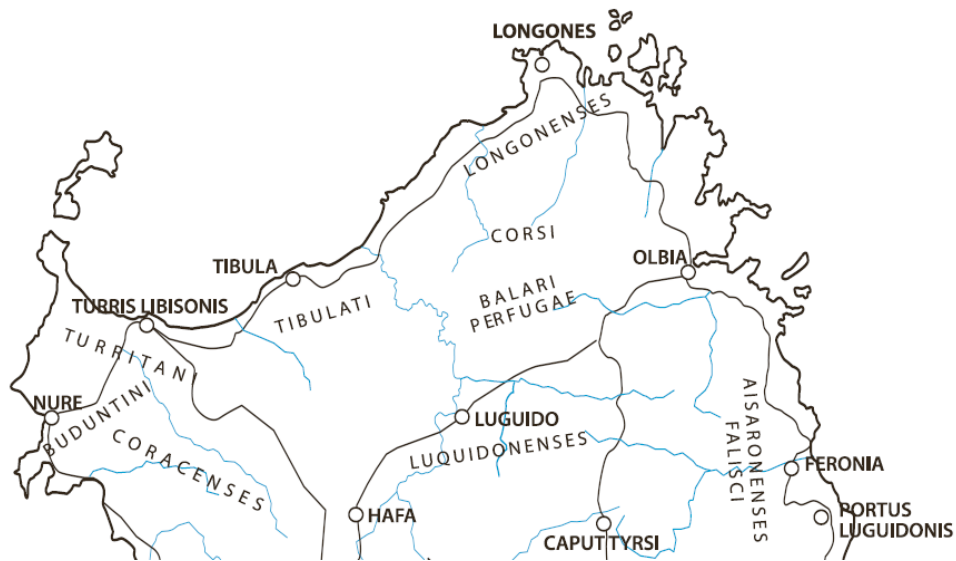
Fig. 2 - Non-urbanised populations of Sardinia (from Mastino 2005 p. 307, fig. 35).

The latter, who probably originated from Corsica, belong to the group of populations in the high Gallura area who blocked the Phoenician-Punic colonisation (fig. 3) and made the Roman one difficult too.