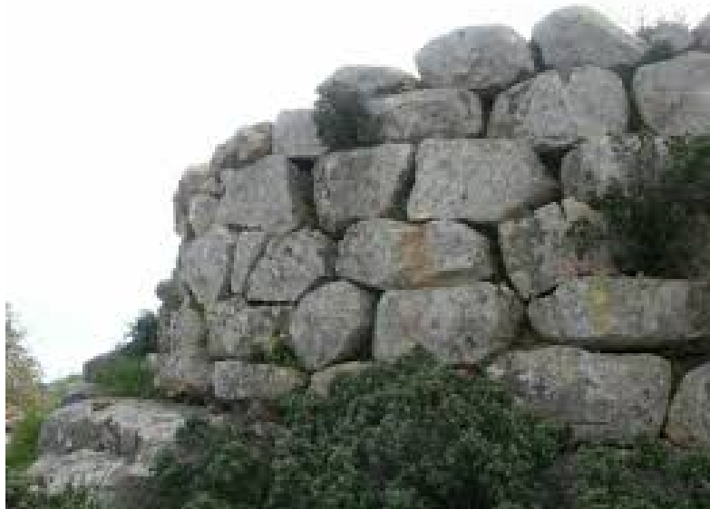
Fig. 1 - Nuraghe on Monte Ruju.

Four nuraghe are from the Nuragic period, however (1700-900 B.C.): Monte Pizzari, Chiramaria, Monte Ruju (fig. 1) and one without a name in the area of Stazzi Naracheddu (fig. 2).