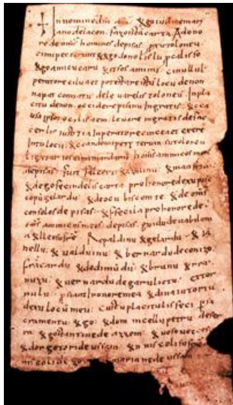
Fig. 1 - Logudoro Privilege act: parchment.

The State Archives in Pisa safeguard an important document, considered the oldest written document written in Sardinian: the so-called Logudoro Privilege act (fig. 1).