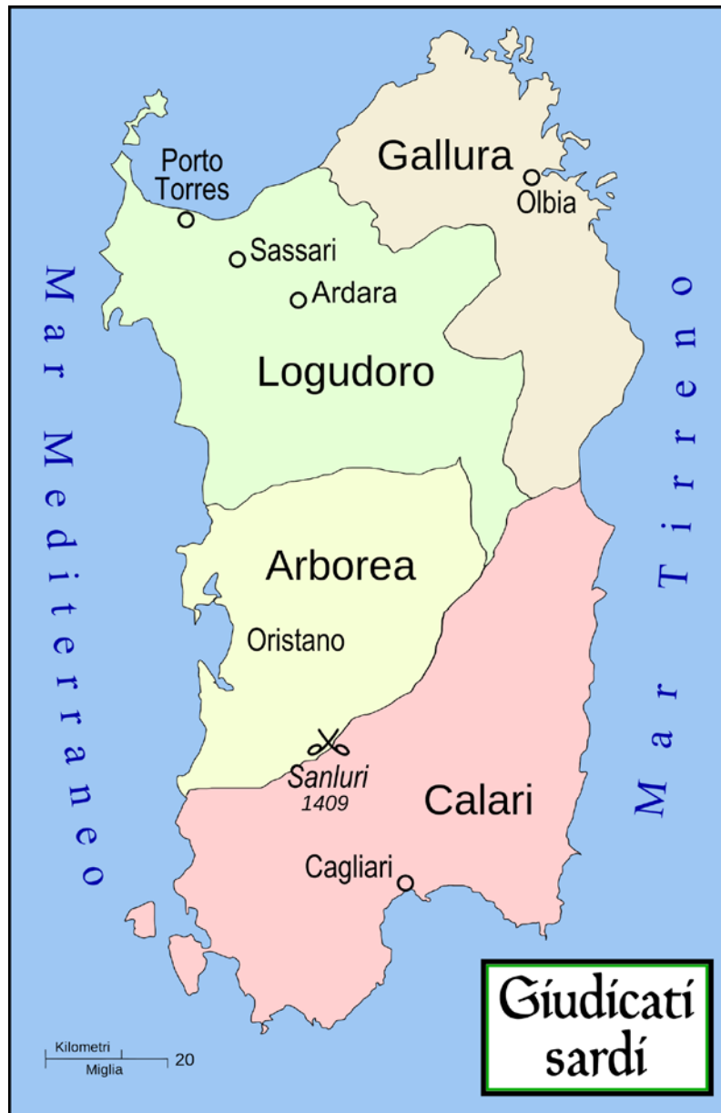
Fig. 3 - Map of the Sardinian Giudicati.