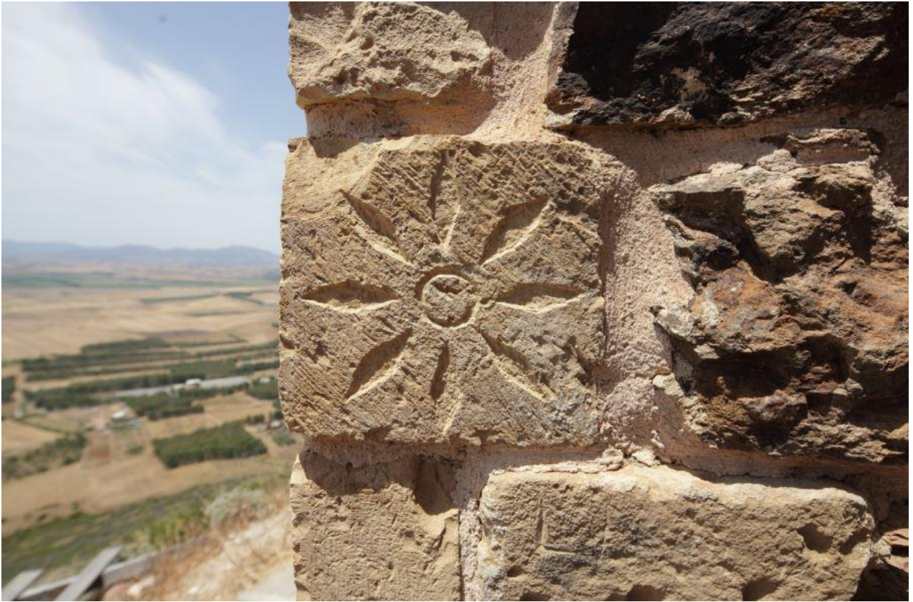
Fig. 2 - Decorative element in the keep wall.