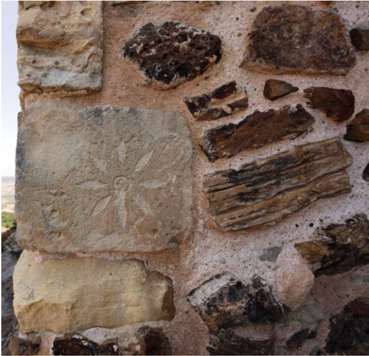
Fig. 3 - Decorative element in the keep wall.