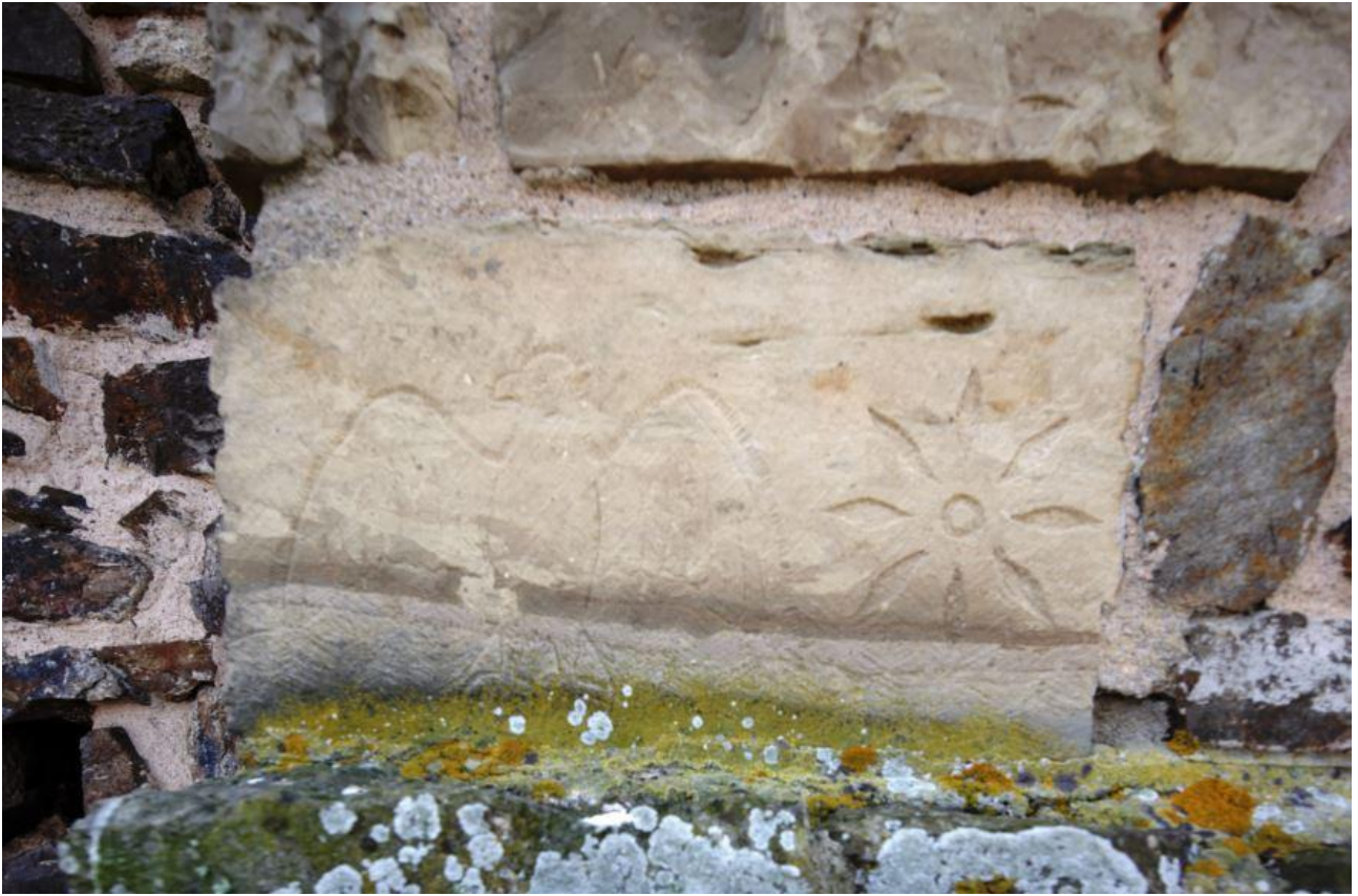
Fig. 4 - Block with decorative elements in the keep wall.