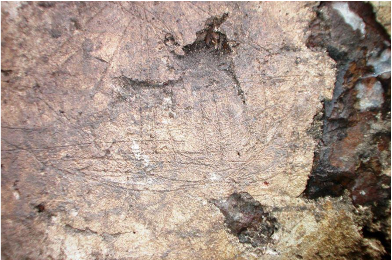
Fig. 3 – The graffiti showing the caravel.