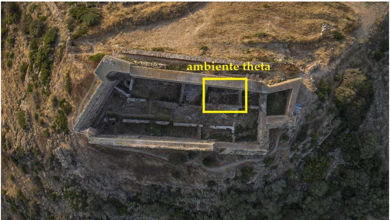
Fig. 1 - The theta room inside the Monreale keep.

The archaeological dig inside the theta room (fig. 1) revealed a large cooking area, where the stratigraphic sequence shows that this kitchen area was used for a long period of time, producing the enormous accumulation of waste found in the nearby iota room 1 .