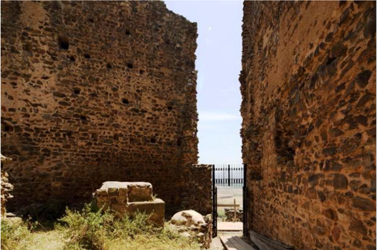
Fig. 1 - The entrance to the keep seen from inside (photo by Unicity S.p.A.).

To enter the keep in Monreale castle it was necessary to come through a gate and a port-cullis, situated one after the other, in the south-west corner of the building (fig. 1).