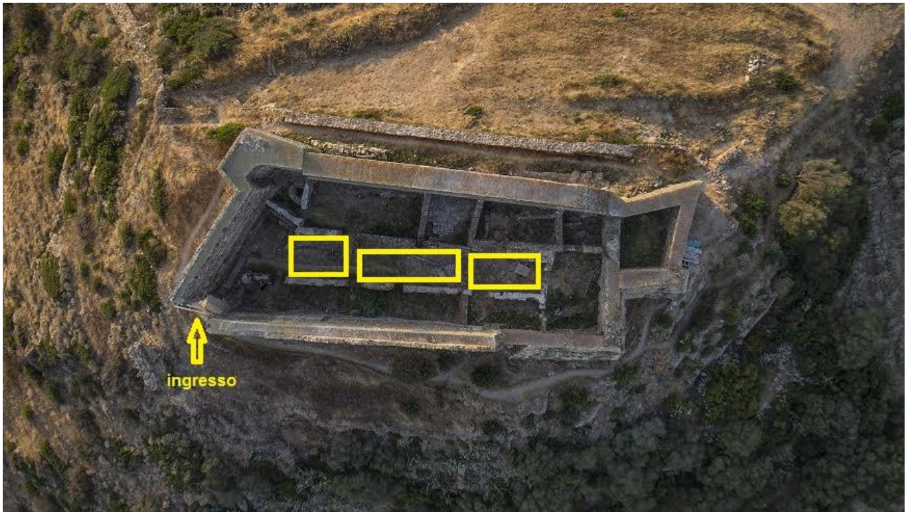
Fig. 2 – The keep courtyards (reproduction by M. G. Arru).

All the areas in the keep opened onto the inner courtyard, divided into various sectors arrange upwards to follow the shape of the hill (fig. 2) 2 . After the entrance area, moving inwards, there is a first courtyard, also with a stone floor, where a small counter can be seen against the wall south of the kappa room. A channel for water to enter the cistern in the entrance and a communicating well with the latter are also still visible.