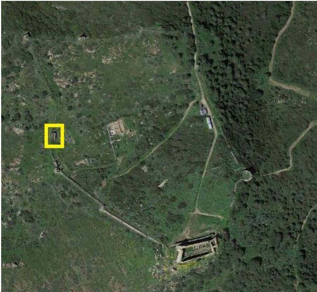
Fig. 2 - The fortified complex of Monreale with the location of the building known as Su Zubu (reconstruction by M.G. Arru, from Google Earth).