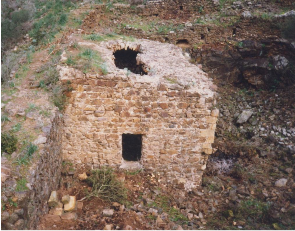
Fig. 5 - Su Zubu.