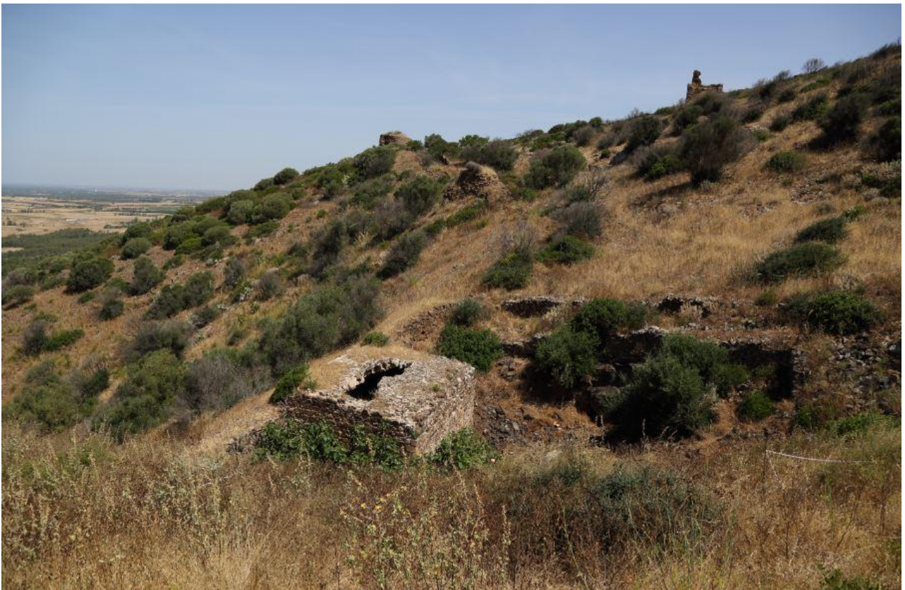
Fig. 4 - Su Zubu.