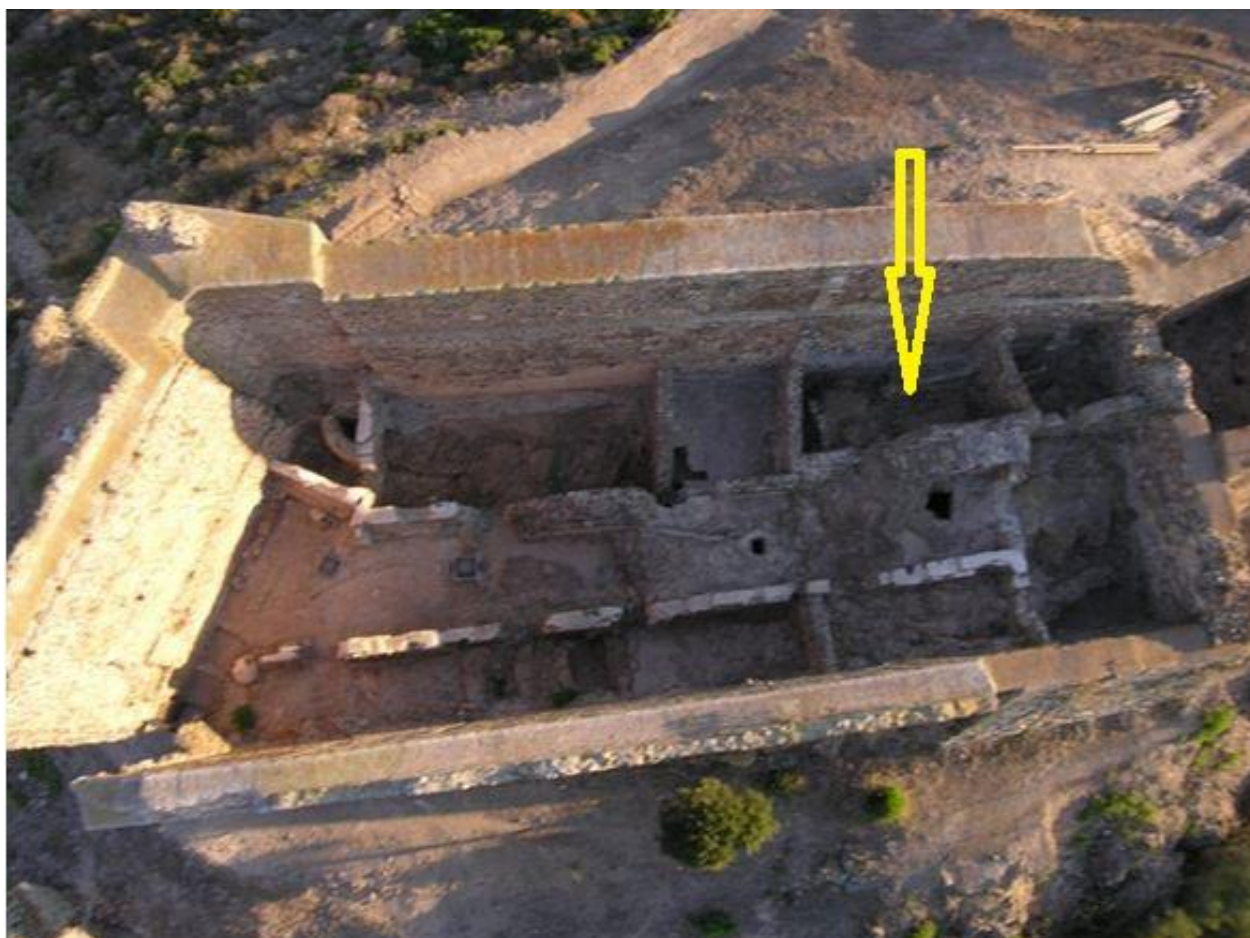
Fig. 2 - The keep seen from above with an indication of the theta room (reconstruction by M. G. Arru, photo by R. Bordicchia).