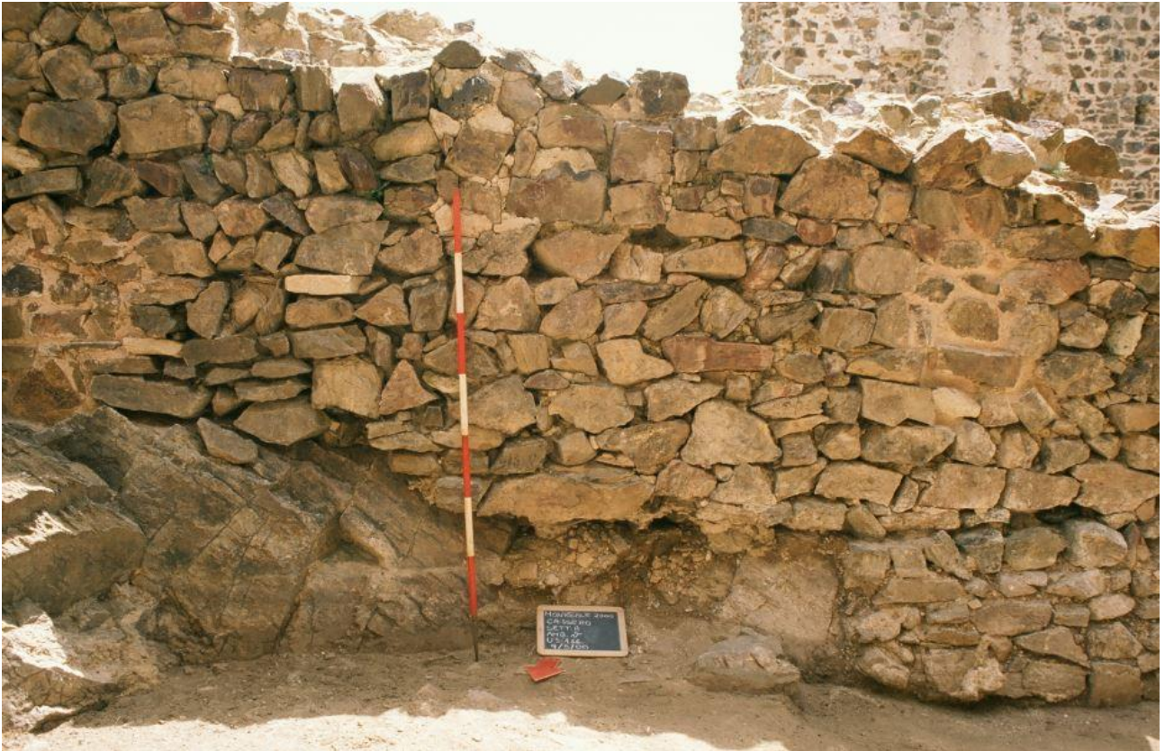
Fig. 5 - The theta room seen from the east.