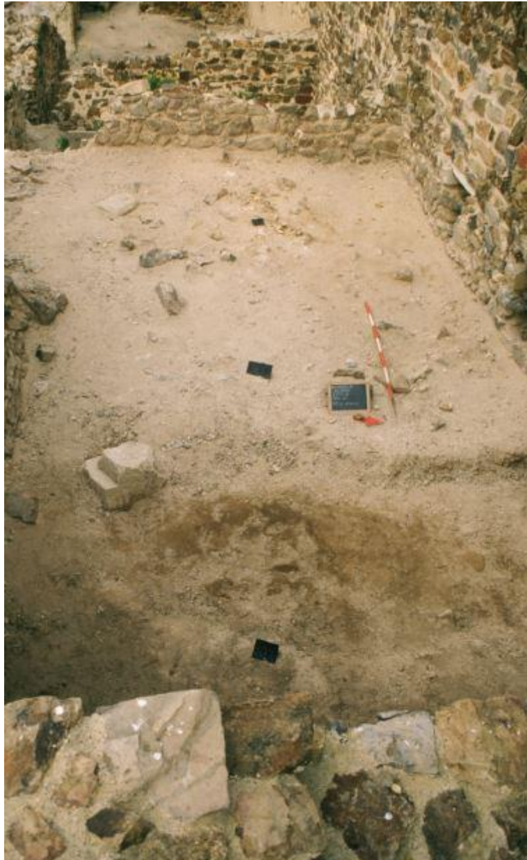
Fig. 4 - The theta room seen from the east.