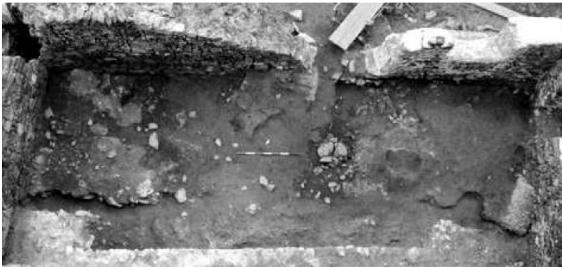
Fig. 3 - The kappa room (from STASOLLA 2010, p. 46).