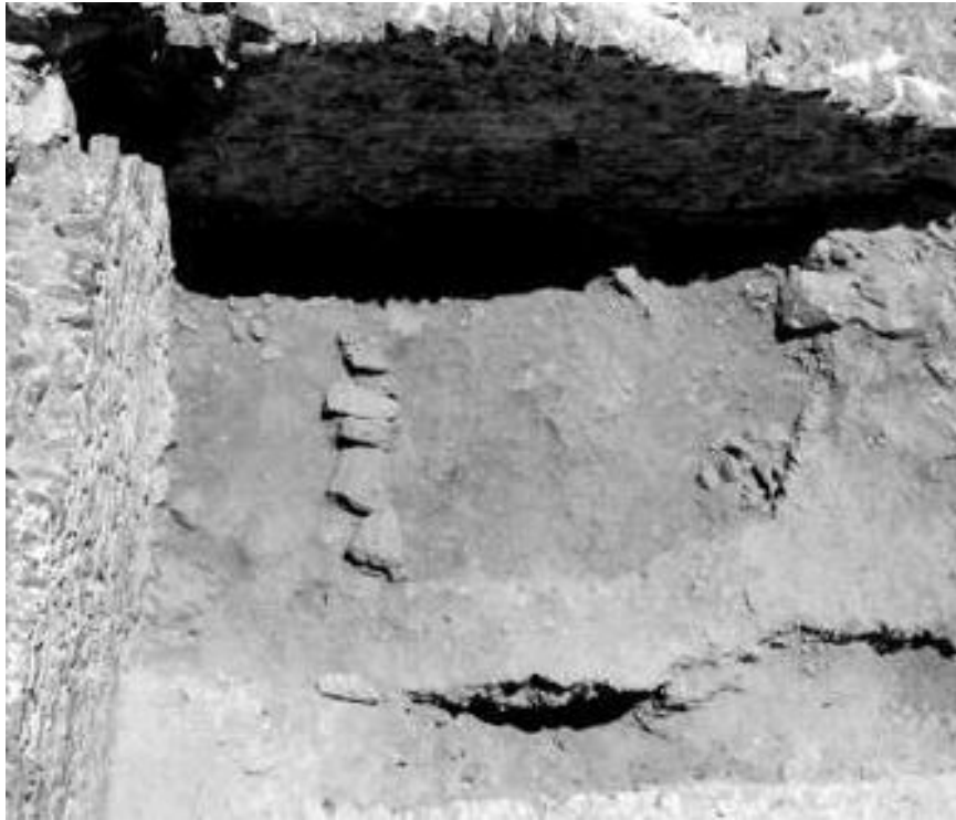
Fig. 4 - Kappa room: underground hut (from STASOLLA 2010, p. 48).