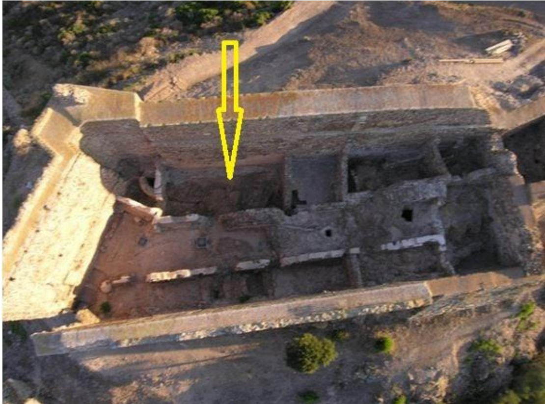
Fig. 2 - The keep seen from above with an indication of the kappa room (Reconstruction by M. G. Arru).