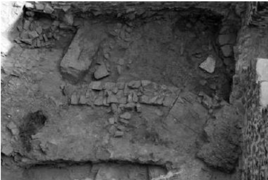
Fig. 5 - Kappa room: structures for the ironworks (From STASOLLA 2010, p. 48).