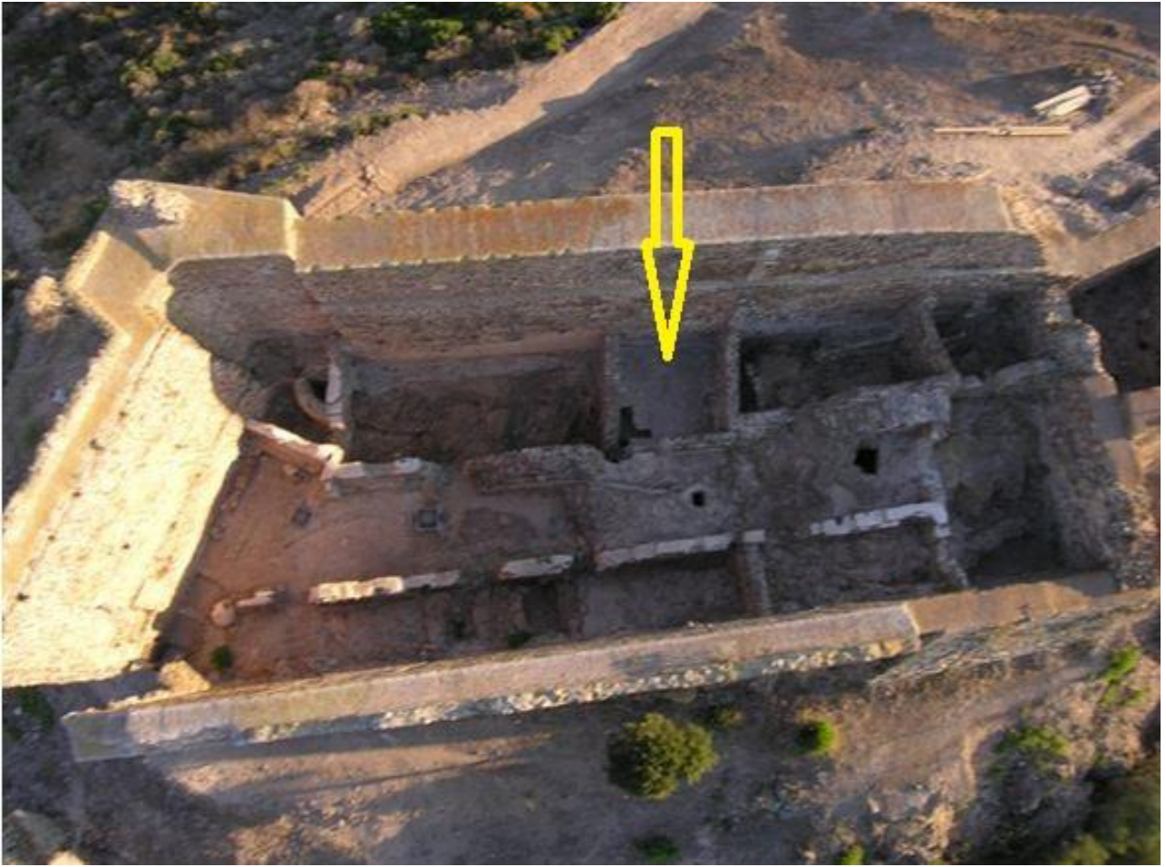
Fig. 2 - The keep seen from above with an indication of the iota room (reconstruction by M.G. Arru).