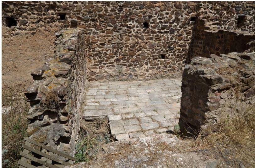
Fig. 4 - The Iota room and its floor.