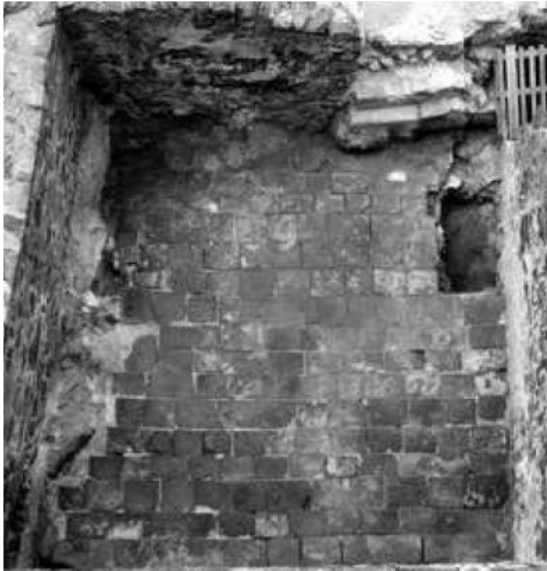
Fig. 3 - Iota room; floor in trachyte slabs (by Stasolla 2010, p. 49).