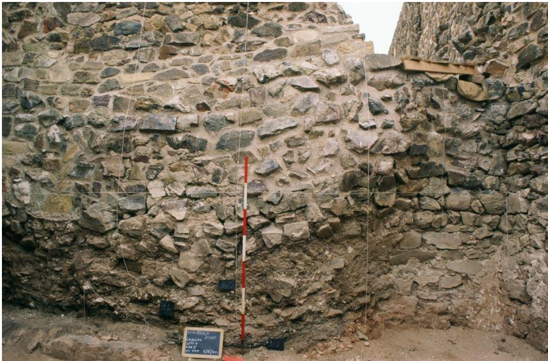
Fig. 4 - Interior of the gamma room (reconstruction by M. G. Arru).