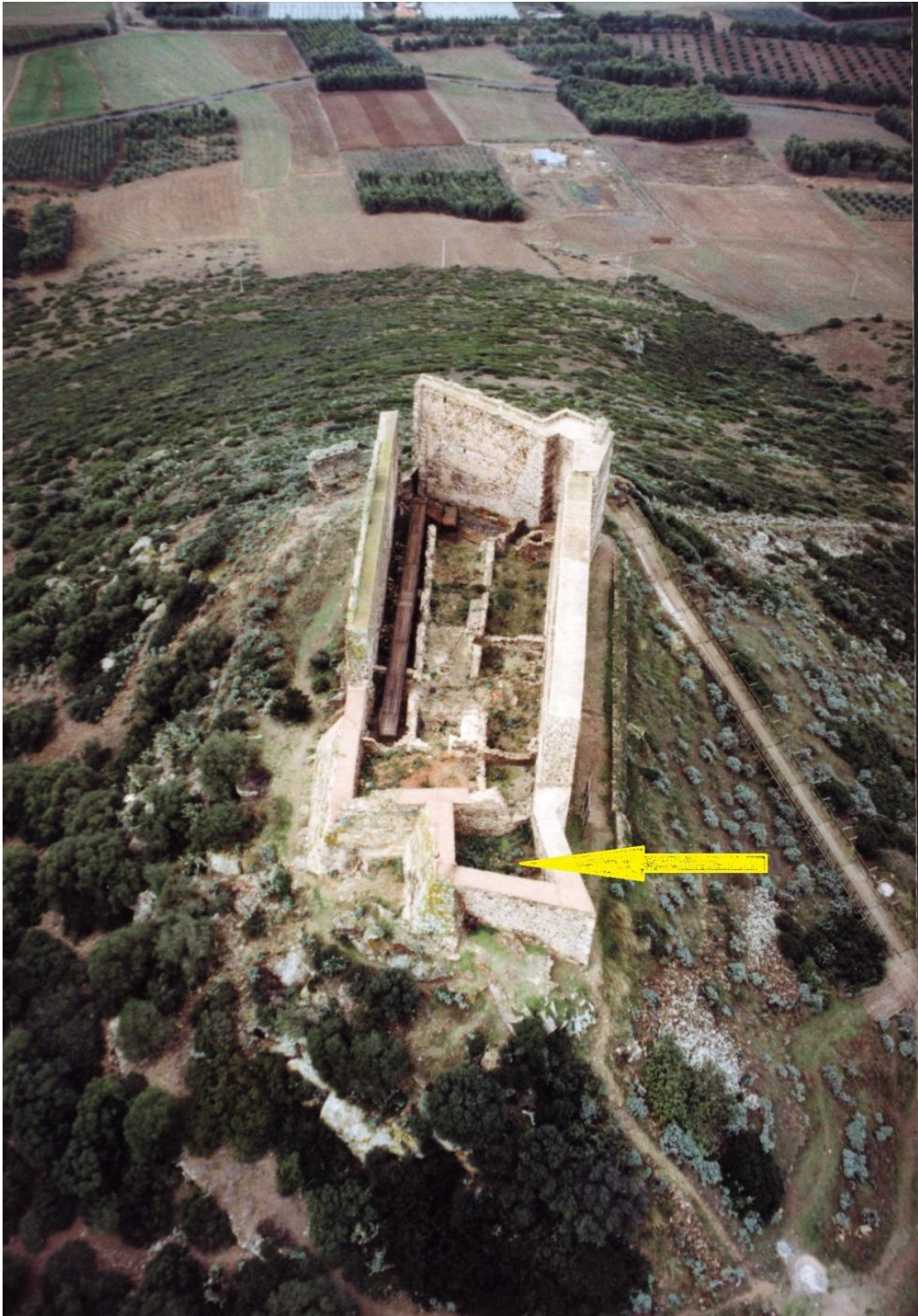
Fig. 2 - Aerial view of the keep with an indication of the room (Reconstruction by M. G. Arru).