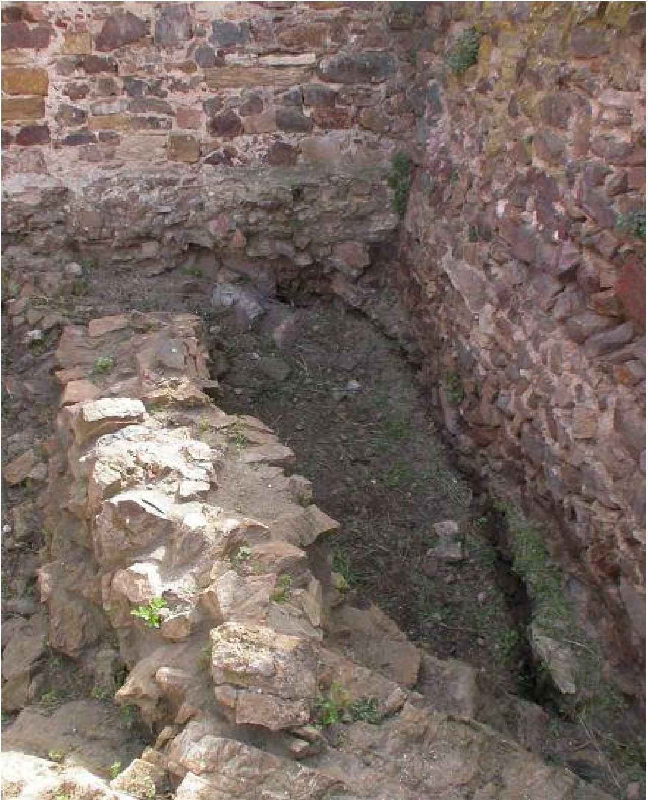
Fig. 4 -Curved wall relating to a Nuraghic hut.