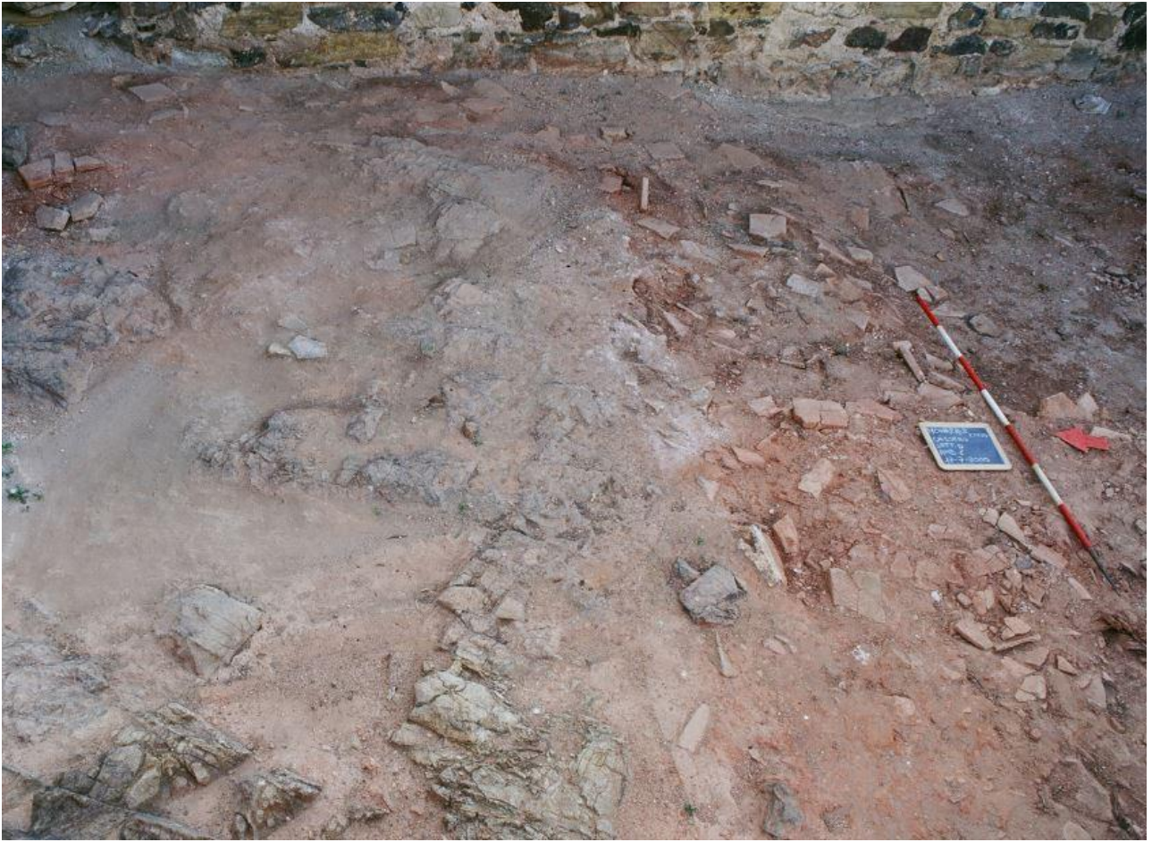
Fig. 3 - Detail of the stone counter inside the epsilon room.