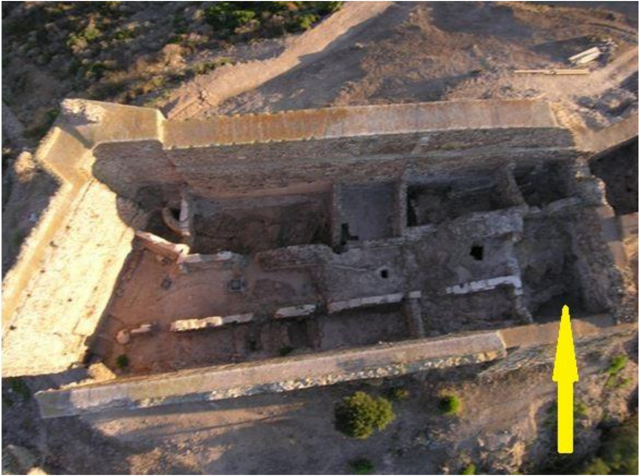
Fig. 2 - The keep seen from above with an indication of the epsilon room (reconstruction by M. G. Arru, photo by R. Bordicchia).