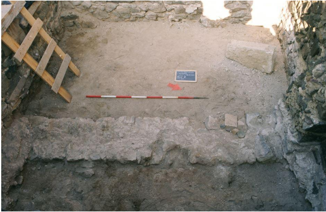
Fig. 3 - The delta room seen from the East.