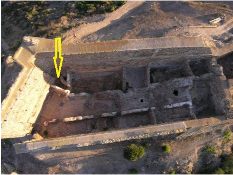
Fig. 2 - The keep seen from above with an indication of the alpha room (reconstruction by M. G. Arru).