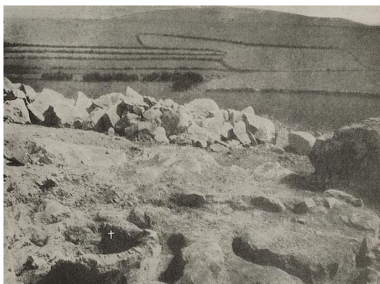
Fig. 1 - The truncated cone structure interpreted by A. Taramelli as the remains of a smelting furnace (from Taramelli 1918, coll. 111-112, fig. 112).

Sardinia was involved in the phenomenon of colonisation of the western Mediterranean by the Phoenicians between the 9th and the middle of the 6th century B.C. From the second half of the 6th century to 238 B.C. It came under the dominion of the Punicians. In the Municipality of Sardara there are several settlements attributable to the Punic phase which were developed in the Nuraghic areas, as is evidenced by the findings in the localities of Nuraghe Arrubiu, Canali Linu, Nuraghe Axiurridu, Nuraghe Perra, Nuraghe Arrigau and Santa Caterina 1 . In particular, one of the towers of the nuraghe Ortu Commidu returned artefacts testifying to its reuse during the Punic age: these are fragments of amphorae and ceramic pieces with rough "finger-mark" grooves, attributable to a particular type of oven for baking bread, still in use in North Africa, called tabouna 2 .