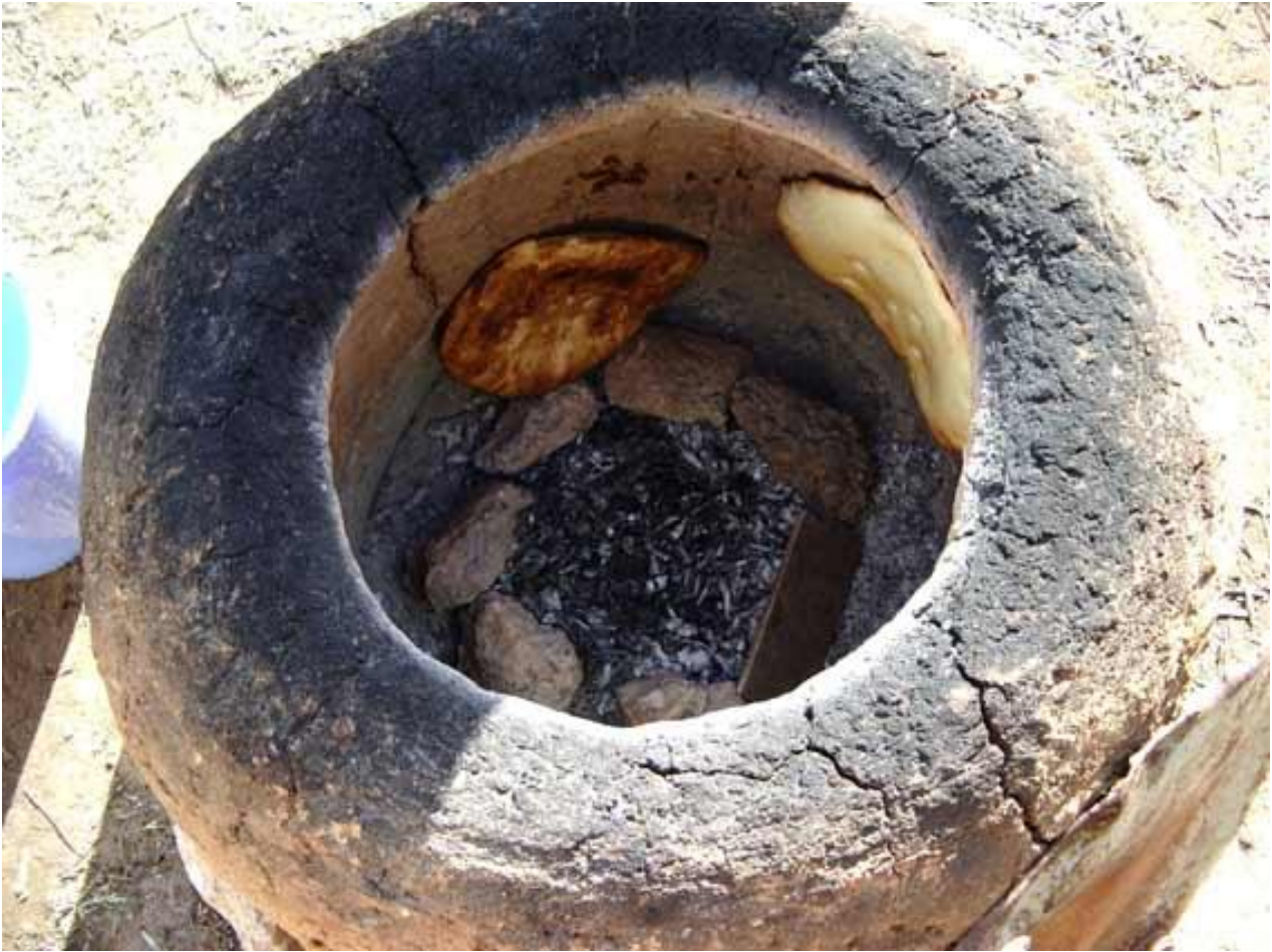
Fig. 3 - An example of tabouna oven (from http://www.nabeul.net/?nomPage=rec_details&ma_recette=43 ).