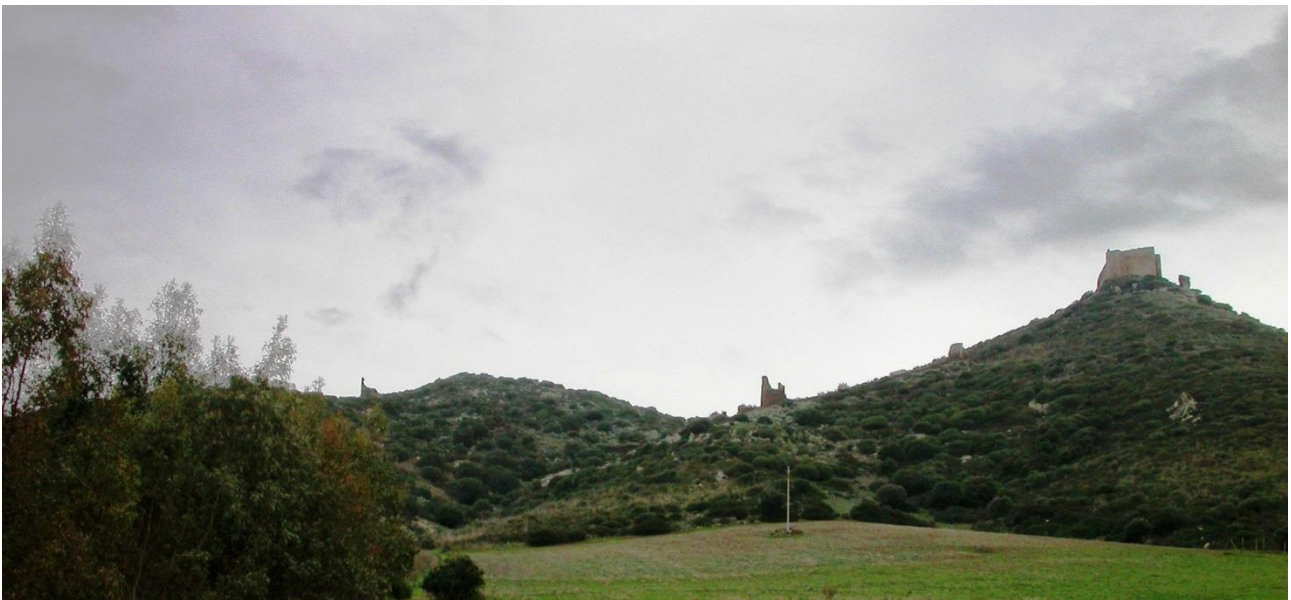
Fig. 1 - The hill and the fortified complex of Monreale.

The keep stands on a steep hill, at a height of 387 metres above sea level (fig. 1). The perimeter walls of the fort are still visible, about ten metres high and contains an inner area of about 720 square metres (fig. 2). The keep, which has the shape of an irregular stretched trapezium, with the north and south sides parallel to each other and the Western one oblique in respect of the first two. The entrance, in one corner where the south and west walls meet, leads into the keep's interior that has several rooms: five along the northern wall, two along the southern wall, one on the south-east side, plus another space that is a tower on the north-east side (fig. 3). These rooms, of which only the ground floor remain, were spread over several floors, as can be seen from the holes used to house the wooden floors of the upper storeys. All the spaces, both on the ground floor and on the upper floors, were only illuminated by windows overlooking the inner courtyard. The building consisted of an irregular building made of local schist, trachyte, granite and limestone stones, all bound by abundant mortar.