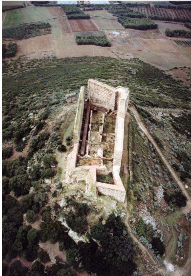
Fig. 2 - The keep seen from above (photo by R. Bordicchia).