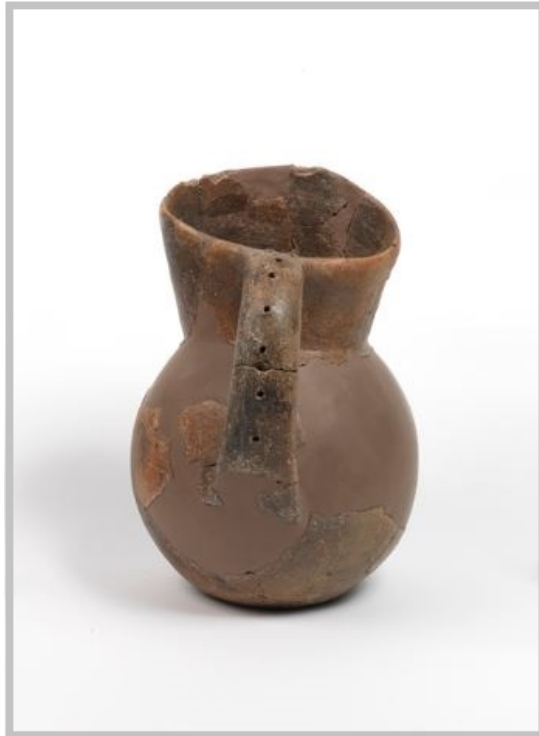
Fig. 2 - Askoid jug from the archaeological site of the former town hall, Sardara, IX-VIII century BC, detail of the handle (from BAGELLA 2014, sheet 46, p. 238).