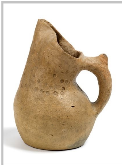
Fig. 3 - Askoid jug from the Nuraghic complex of S. Anastasia, Sardara, IX-VIII century BC, (from BAGELLA 2014, sheet 48, p. 238).