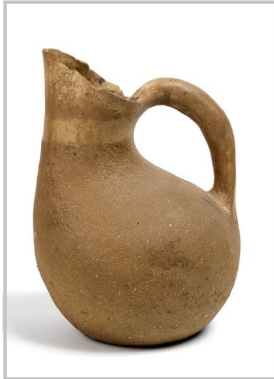
Fig. 4 - Askoid jug from the Nuraghic complex of S. Anastasia, Sardara, VIII-VI century BC, (from Bagella 2014, sheet 50, p. 239).