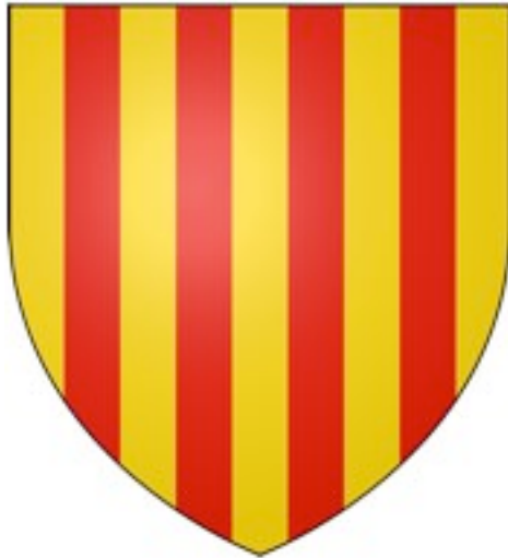
Fig. 3 - The coat of arms of the Crown of Aragon (from http://commons.wikimedia.org/wiki/File:Aragon_Arms.svg ).

This vitreous fragment, therefore, could be proof of the presence in Monreale of members of the family of the Judges of Arborea or of a member of the House of Catalonia and Aragon, who not only were the only ones allowed to use artefacts with the Crown coat of arms, but who also had the economic means to commission a luxury product such as these glasses, personalised with the desired decoration.