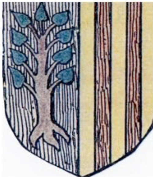
Fig. 4 - Coat of arms of the Giudicato of Arborea: an uprooted Arborea tree and the poles of Aragon (from http://upload.wikimedia.org/wikipedia/it/a/af/Stemma_giudicato_di_arborea.jpg ).

This vitreous fragment, therefore, could be proof of the presence in Monreale of members of the family of the Judges of Arborea or of a member of the House of Catalonia and Aragon, who not only were the only ones allowed to use artefacts with the Crown coat of arms, but who also had the economic means to commission a luxury product such as these glasses, personalised with the desired decoration.