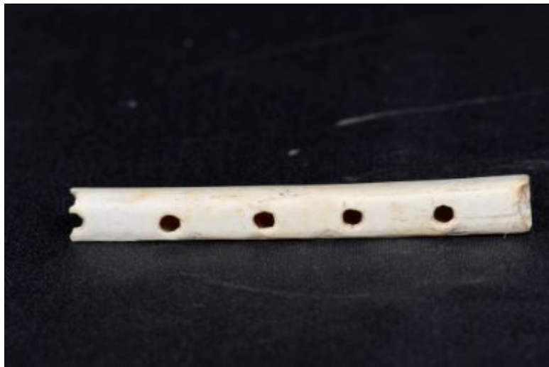
Fig. 1 - Fragment of bone flute from the castle of Monreale.

Among these materials, there is one of particular interest: a flute made of bone (incomplete), which could indicate a royal environment in the castle because of the likely presence of musicians (fig. 1).