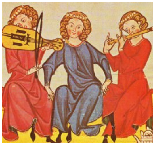
Fig. 3 - Miniature with viola and flute, XIV century.