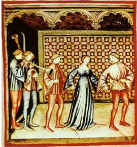
Fig. 4 - Music and dance, drawing from the Tacuinus sanitatis casanatensis , XIV century ( http://it.wikipedia.org/wiki/Musica_medievale#mediaviewer/File:40-svaggi,suono_e_ballo,Taccuino_Sanitatis,_Casanatense_4182.jpg ).