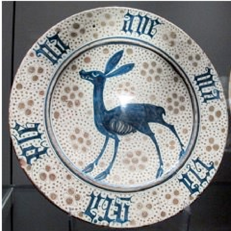
Fig. 3 - Example of a basin from the "Ave Maria series", Manises

( http://commons.wikimedia.org/wiki/File:Manises,_bacile_con_cerbiatto_e_iscrizione_ave_maria_gratia_plena,_1400-1450_ca..JPG ).