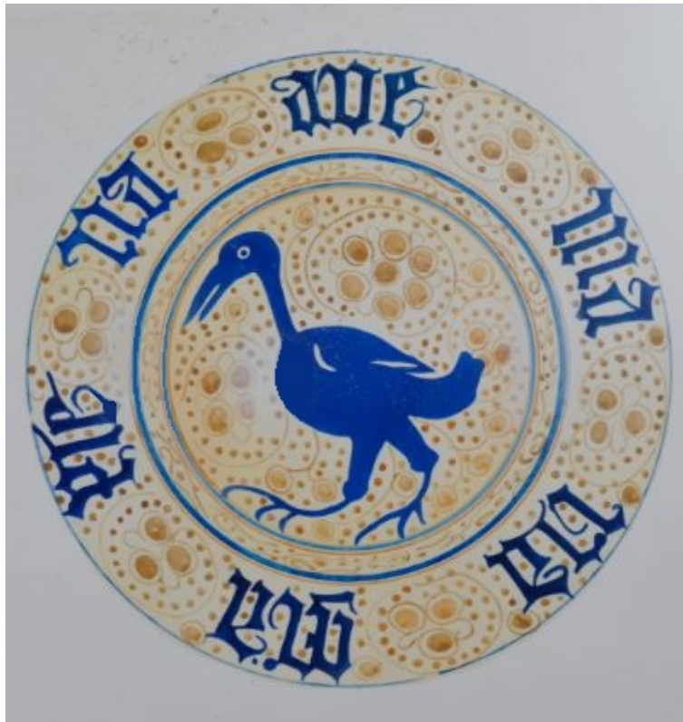
Fig. 2 - Example of a dish from the "Ave Maria series", Manises (from RAVANELLI GUIDOTTI 1992, photo 37, p. 68, sheet 37).

The epigraphic part always used Gothic letters painted in blue, whilst metallic lustre was used for the background which, sometimes, could have a warmer tone. In fact, to save on production costs, the amount of copperoxide was increased while the silver content was lowered.