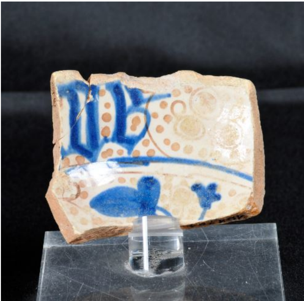
Fig. 1 - Fragment of a bowl with the letters "VE" from the castle of Monreale.

During the archaeological investigations carried out in 1992 in the so-called "butto" (dump) of the castle of Monreale, a fragment of a hemispherical bowl in Valencian majolica, decorated in blue and lustre, attributable to the so-called "Ave Maria series" was found together with numerous other pottery artefacts (fig. 1).