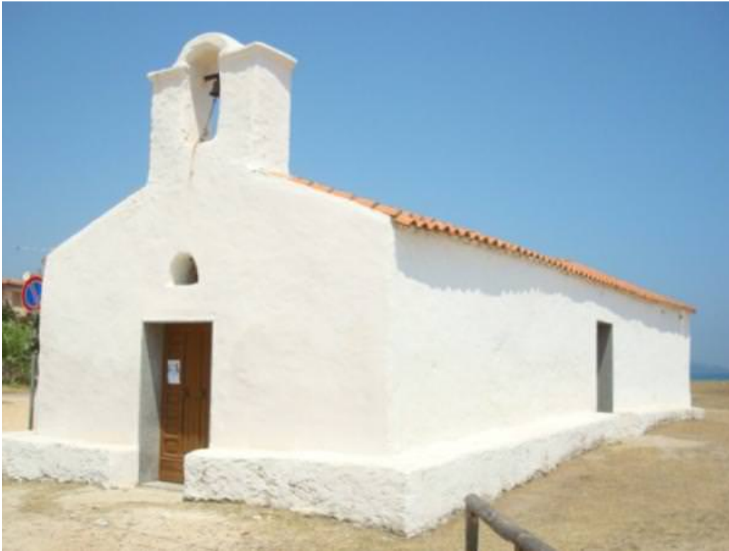
Fig. 3 - Church of St. John, identifiable with the Ecclesia Sancti Johannis de Portunono in ancient documents.