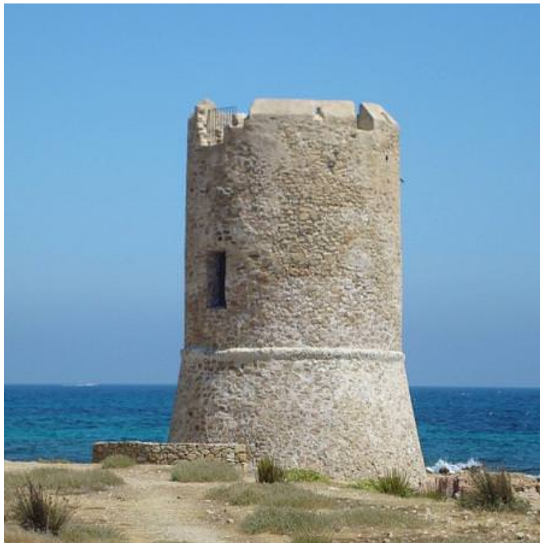
Fig. 2 - Tower of San Giovanni, in the location with the same name in the municipality of Posada.