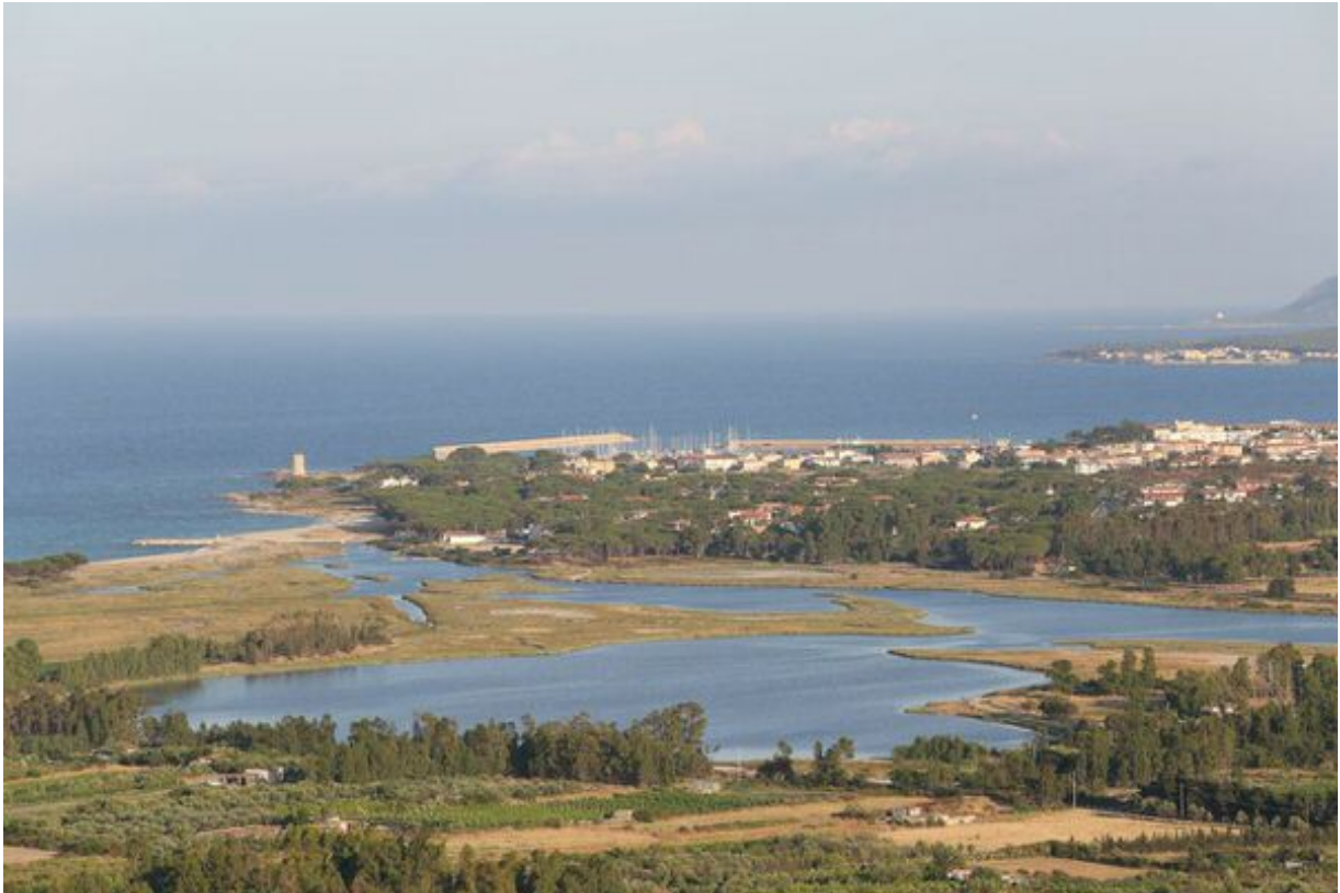
Fig. 1 - San Giovanni of Posada, view from the Castello della Fava.