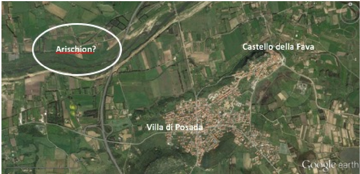
Fig. 2 - Probable location of the ancient village of Arischion (from Google Earth, re-elaboration by E. Dirminti).