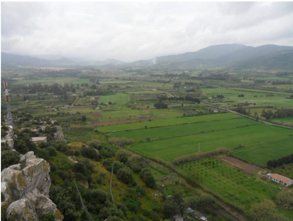
Fig. 3 - Territory to the north-west of the Castello della Fava, where the Arischion village probably stood.