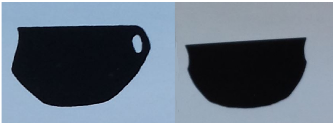
Fig. 1 - General examples of carenated cups (from Corda, Frau 2001).

The carenated cups are terracotta containers used daily, normally with a handle and used to drink. Items of this type (fig. 1) were found in the entire area of the monument and differ in the position of the carenated bottom (sharp edge or just visible, or visible only on outside) and the height and shape of the neck (almost vertical, bending inwards and turned to the outside; fig. 2). The cups are modelled by hand, with a very careful finish of the details. The handles, when present, are bands (fig. 3); some examples have small grips with or without a hole, applied on the carina. One cup is different to the others as it has four diametrically opposite grips on the line of the carina, and has bulges on the lower part of the outer surface (fig. 4).