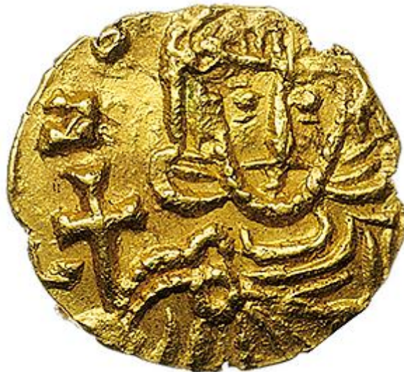
Fig. 2 - Tremissis of Leo III, Syracuse.

Among the artefacts found in the tombs of the necropolis of Part'e Sole there is a Byzantine Age coin, a tremissis, attributed to Emperor Leo III (figs. 2-3), whose discovery is particularly important because, during the reign of this sovereign, the Sardinian-Byzantine coin issue, which had begun with Constantine IV and is attributable to a mint probably located in Cagliari, ended. These coins are usually marked with the letter S (for Sardinia) on the obverse; this symbol, though, does not seem to be present on the Posada sample, which is in poor condition (fig. 4).