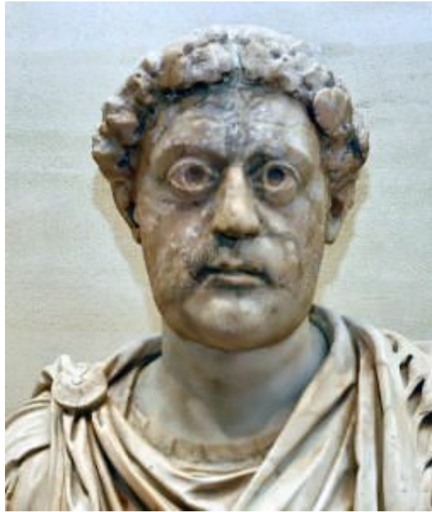
Fig. 3 - Leo III the Isaurian, Emperor of the East from 717 to 741.