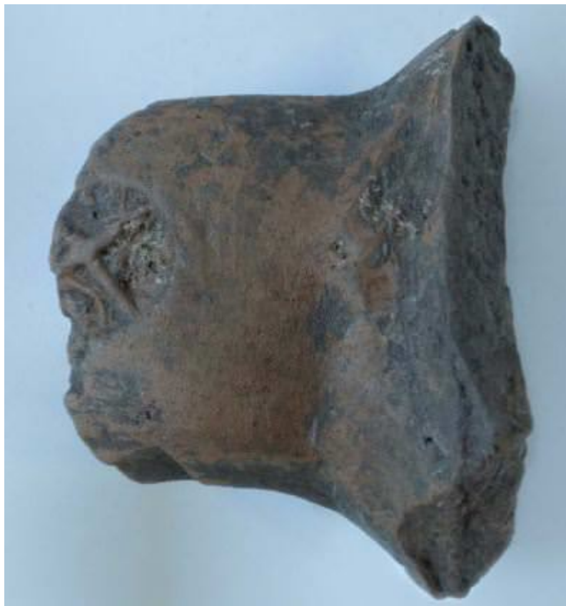
Fig. 3 - Handle with stamp from Posada (from SANCIU 2012, p. 178, fig. 9)