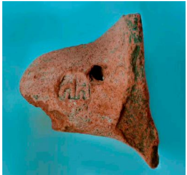
Fig. 2 - Handle with stamp from Posada (from SANCIU 2012, figs. 7-8).