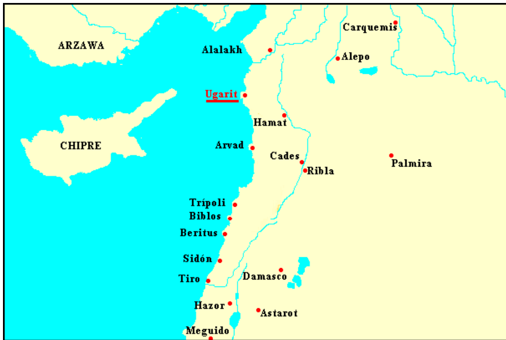
Fig. 8 - The Syrian-Palestine coast with the Phoenicians centres and the city of Ugarit.

A tablet with the inscription, found in 1973 at Ras Shamra (current name of Ugarit) carries a poem entitled " Book of funeral sacrifice ", that begins with the summons to the " Rephaim of the earth ", also designated as ancient Rephaim ; it then goes on to invite people to lay the table with food for some of these spirits, including some ancient kings of the city. It is therefore an eastern version, Syrian in fact, of protective gods, who were worshipped during the 2nd century B.C. There were the eastern equivalent of the Dei Mani from the Roman world, and this analogy is also proven by a Libyan-neo-Punic inscription found in El-Amrouni, from the 1st century A.D., that translated the semitic Rephaim with Dii Manes . The worship of the Rephaim is also reminiscent of the worship of heroes: the glorious ancestors on which the future of a population is based. The term refers to illustrious dead people (monarchs, warriors, people of certain importance), raised to a special rank after death, among the shadows of death. The mythical basis of the worship dedicated to these people is conserved in the events of the god Baal who, as can be read on the Ugarit tables, was forced to face a battle with the terrible Mot , "death", and becomes the protagonist of disappearing into the underworld and then returning to life, a process