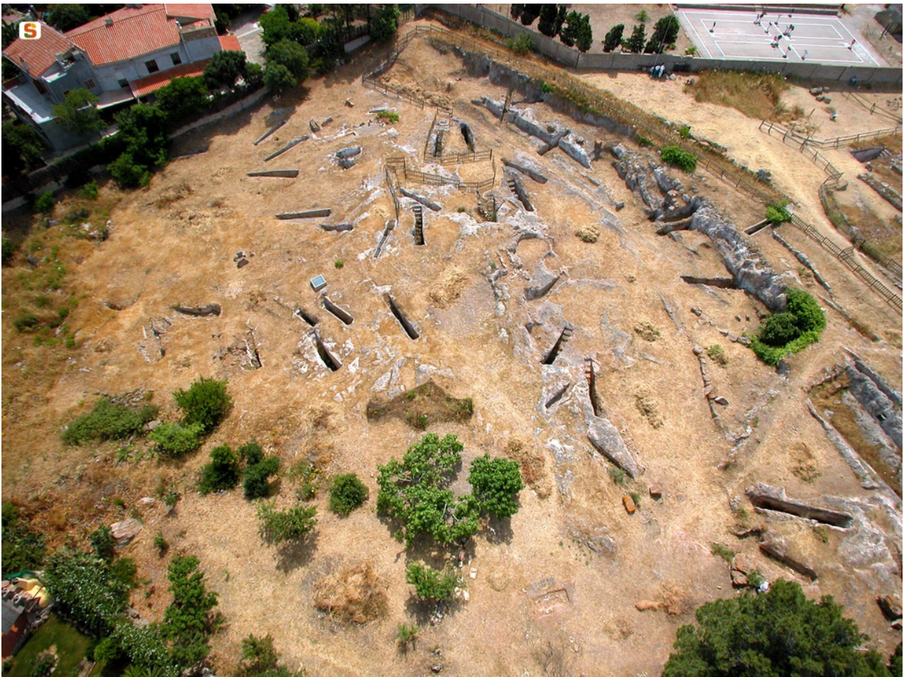
Fig. 1 - View from above of part of the necropolis of Is Pirixeddus (from http://www.sardegna.digitallibrary.it/mmt/480/29043.jpg )

The Phoenicians believed in the survival of the soul after death. Contrary to what the Egyptians did, however, who embalmed their dead, the bodies were cremated or buried. The cremation funeral ritual was typical of the early Phoenician communities in Sardinia (8th-6th centuries B.C.), and then became popular again at a later date (4th-3rd century B.C.), due to the Greek-Hellenistic cultural influence, without ever fully replacing the burial ritual (fig. 1).