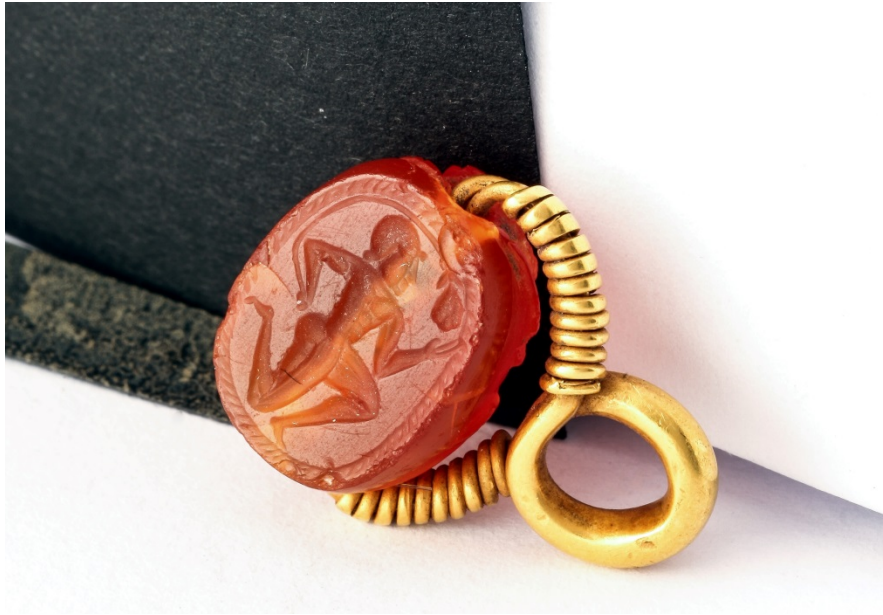
Fig. 6 - Carnelian scarab from Sulky . Municipal Archaeological Museum "F. Barreca"

The body lay among these items, whether buried or cremated, in hypogeum tombs, often dressed in various jewels and embellishments (fig. 7), and according to tradition, the buried body was covered in resins and perfumed ointments, with the intention of contrasting the bad odour of decomposition and perhaps trying to delay it.