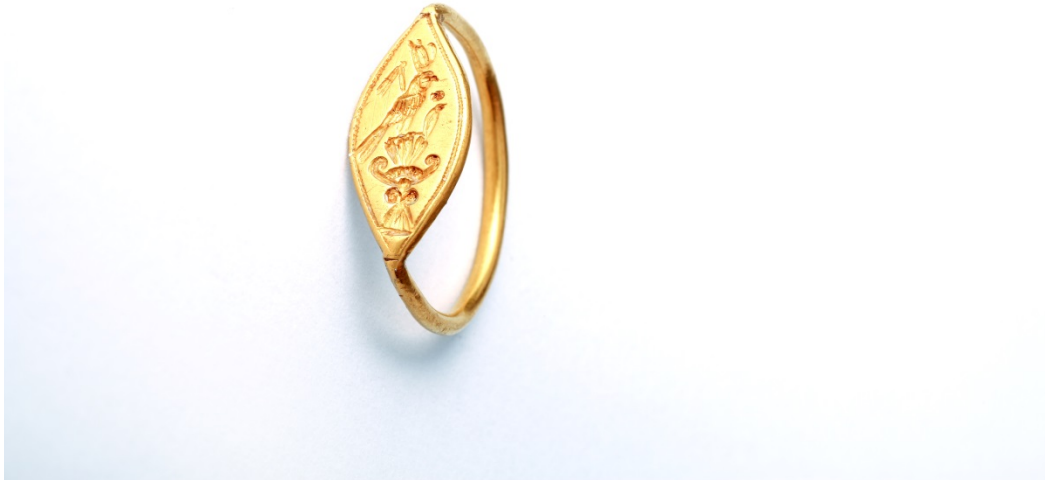
Fig. 7 - Gold ring depicting Horus as a falcon with the insignia of Egyptian power. Municipal Archaeological Museum "F. Barreca"

According to Phoenician-Punic beliefs, the dead person's attitude to the living could be kind or threatening and to be feared, depending on how they had carried out their funeral duties on him/her.