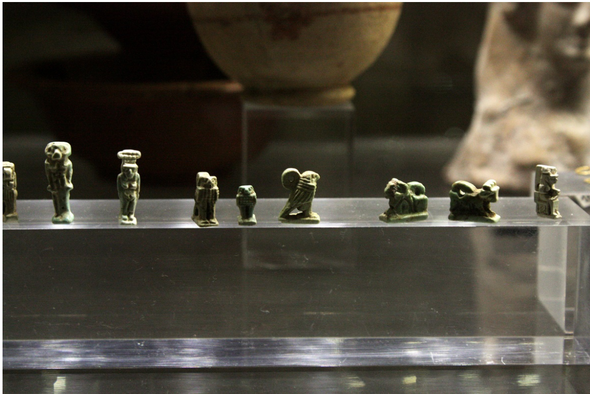
Fig. 3 - Variously shaped amulets, from Sulky. Municipal Archaeological Museum "F. Barreca".

For the journey, magical-religious items were placed next to the deceased: first of all, amulets, which were to protect the deceased from evil spirits (fig. 3); apotropaic masks, that were to chase away the evil spirits (fig. 4); gold or silver sheets with portrayals of the judgement of death, inspired by the Egyptian concept, inserted in a gold or silver amulet holder in the shape of an Egyptian god or a pillar (fig. 5); scarabs, partly amulets, partly seals, used in life and carried to the tomb (fig. 6).