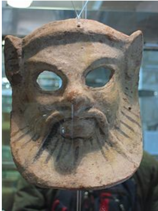
Fig. 4 - Funerary mask of Silenus from Sulky . Municipal Archaeological Museum "F. Barreca".