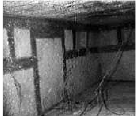
Fig. 6 - Detail of the false door of tomb 7 (from BERNARDINI 2007, p. 156, fig. 10).

Strips, bands and lines are among the most common decorations. Other types, which at the present state of knowledge are unknown in the Punic necropolis of Sulky, are those which reproduce: architectural elements; geometric elements; various symbols of a funerary and sacred nature, such as Tanit or the sun disk and the crescent moon, plant elements and finally the iconography of human characters and animals.