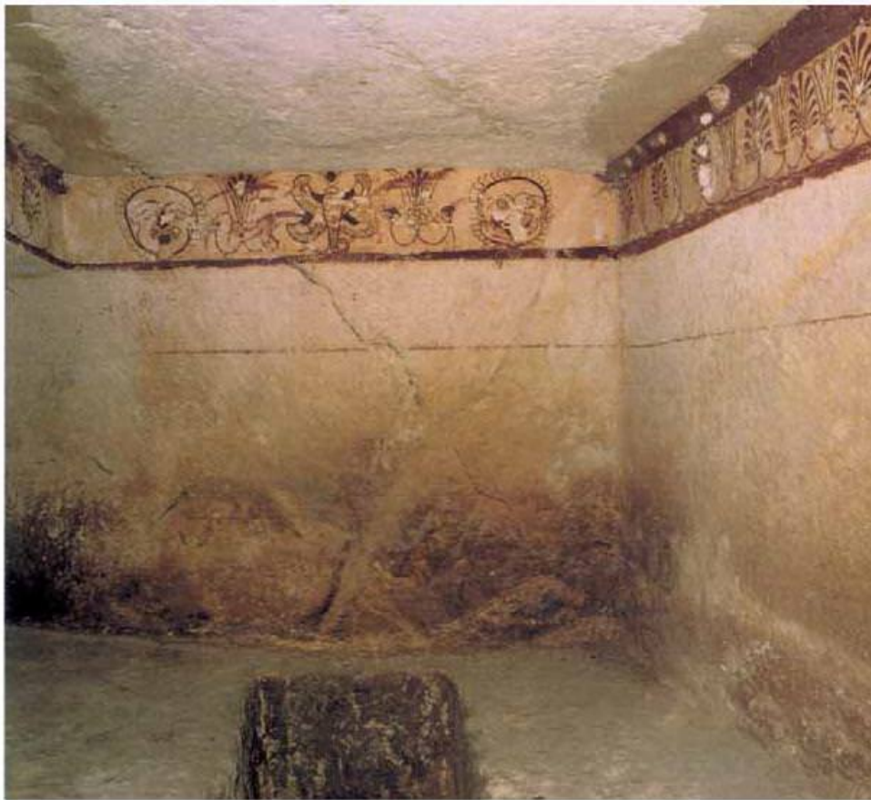
Fig. 1 - The so-called Tomb of "Uraeus" in the necropolis of Tuixeddu (CA) with friezes painted in red.

The Sulky necropolis has only a few tombs with paintings. In spite of the lack of evidence about Sulky , the funeral paintings are one of the most distinctive elements of the hypogeum chamber necropolis of Punic Sardinia. Dominant, in this sense, is the rich Cagliari heritage that represents the most important example in the Mediterranean together with that of Capo Bon, on the north-east coast of Tunisia. The Sardinian funeral painting from the Punic Age was mostly ignored until the discovery of the tombs called "del Sid" and "dell'Ureo" (fig. 1) at the necropolis in Tuixeddu (CA). That together with the necropolis in Kerkouane (Gebel Mlezza), at Capo Bon (figs. 2a - b) have some of the most complex and interesting examples.