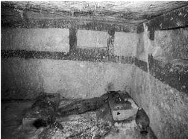
Fig. 5 - Detail of the pictorial decoration on the right side of underground tomb no. 7 and along