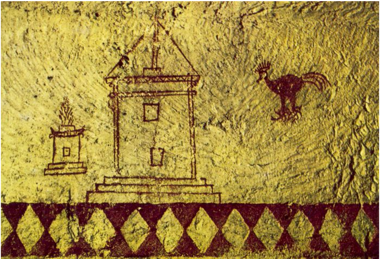
Fig. 2b - Red painted wall in a Punic underground grave in Gebel Miezza datable to the IV-III century B.C. (from MOSCATI 1972, p. 449).

With regard to ancient Sulky, evidence found so far is limited to three tombs: tomb 2 AR that is in tact without later re-use, that can be dated to the first quarter of the 5th century B.C., and is the oldest proof of painting known so far. A second tomb, written about in 1942 by S. Puglisi, seems to have traces of painting but the data is not clear: on five of the nine pillars built with blocks of stone that characterises the tomb, there were "traces of signs made with red paint, which did not seem to contain letters from the alphabet or symbols" . A last tomb, discovered recently, deserves attention: it is tomb no. 7, that can be dated to the second half of the 5th century B.C., judging from its pottery collection, that is in tact, and contains a single buried corpse. The tomb in question has paintings on the walls, but also Egyptian-style relief work showing a male figure with beard and klaft (fig. 4) This figures is sculpted on the central pillar of the burial chamber and faces the threshold.