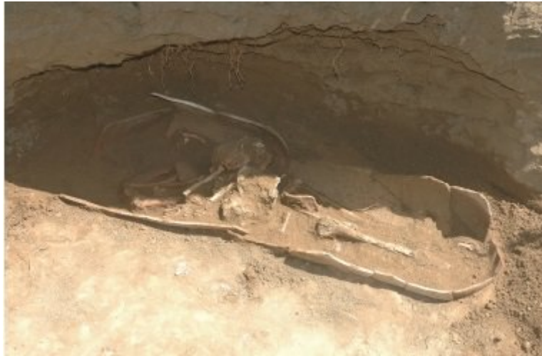
Fig. 3 - Enchytrismos burial which combines two jars to allow the burial of an adult, at the necropolis of Agrigento from late ancient and medieval times (from CAMINNECI 2012, p. 123, fig. 11).

As concerns the Punic Age, the enchytrismos burial appears during the latter part of the sixth century B.C. and endures until the beginning of the fourth century A.D. It was carried out with large commercial amphorae where the children were buried and then placed in a dedicated area within the necropolis.