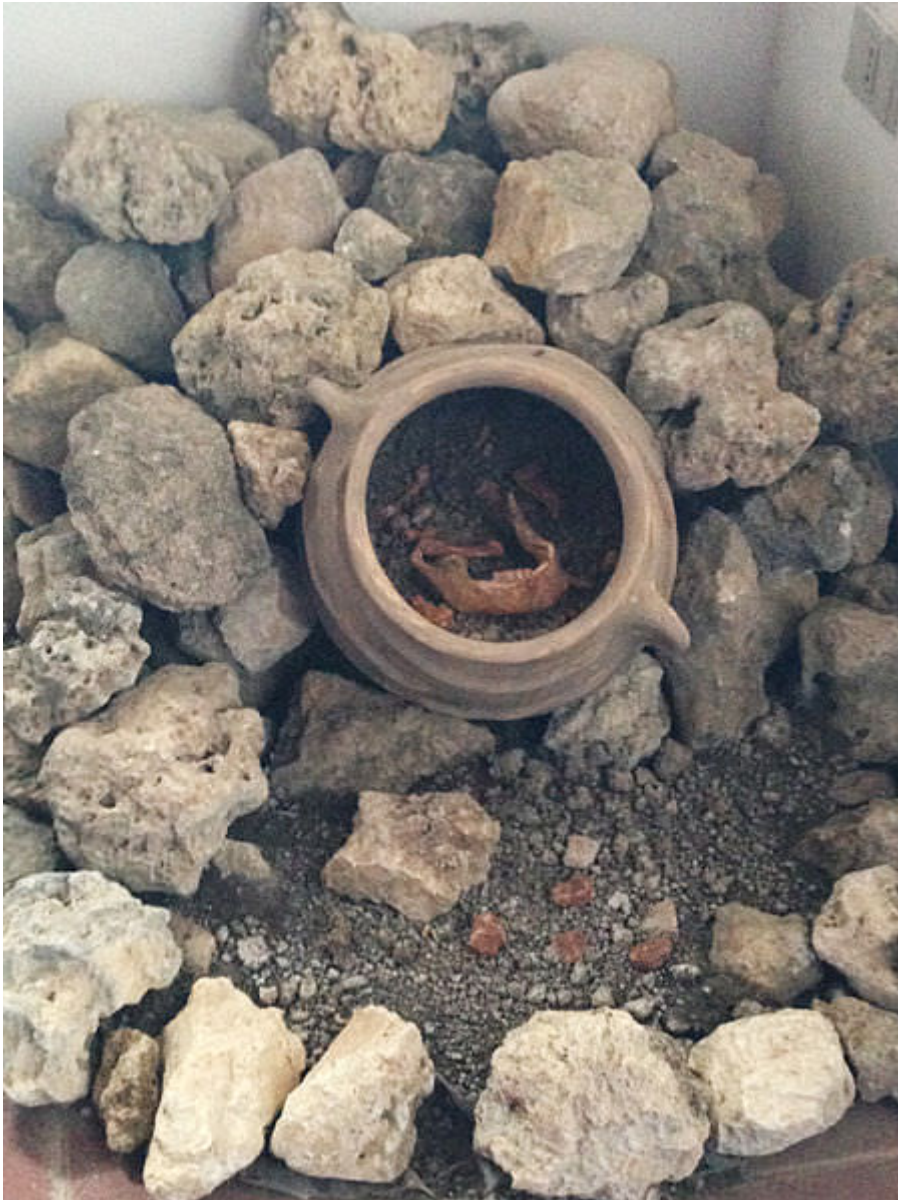
Fig. 2 - Reconstruction of an enchytrismos burial for infants.

In the case of adult burials, as the amphorae were too small to contain the body, they used two, which, once cut from the shoulder diagonally and then again vertically in order to allow the body to be inserted, were united so as to form a single container for the body (fig. 3).