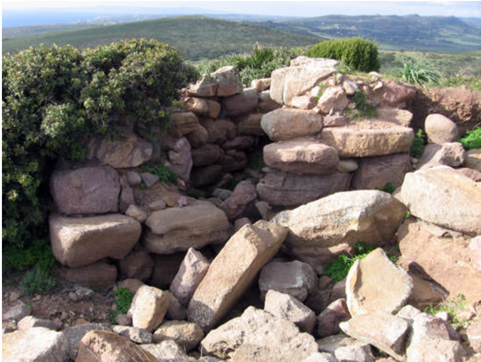
Fig. 4 - The remains of the Nuraghe Grutti Acqua