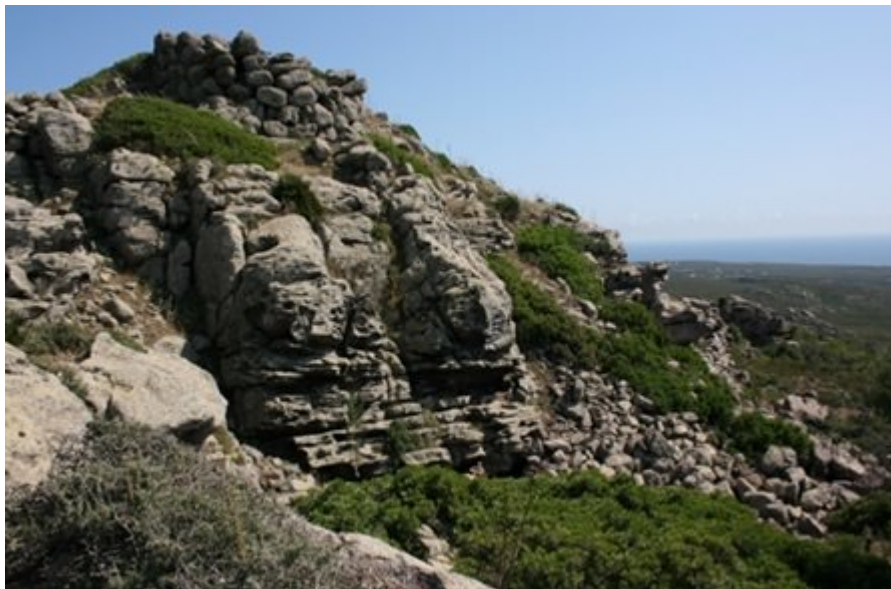
Fig. 5 - The remains of the Nuraghe Corongiu Murvonis (from http://www.parcogeominerario.eu/index.php/Sulky/siti-culturali/nuraghe-corongiu-murvonis-santantioco?lang=it ).