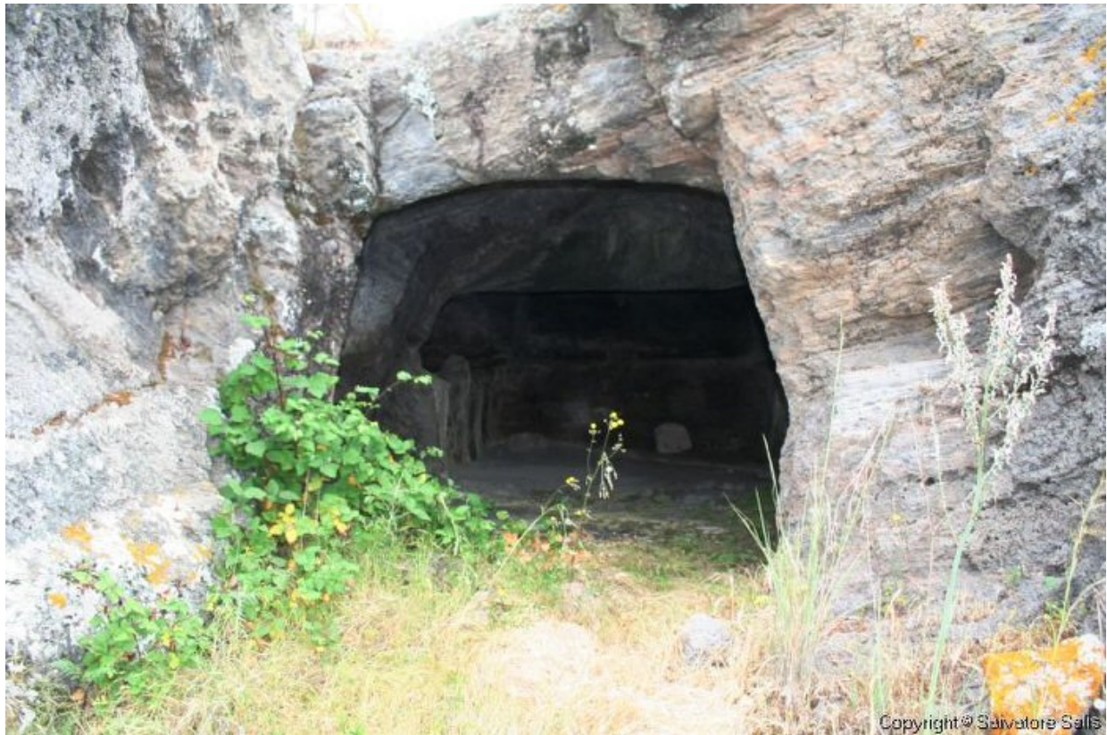
Fig. 2 - One of the Domus de Janas of Mount Isa Baccas.

The Domus de Janas of Mount Isa Baccas also belong to the Late Neolithic Age (2500 B.C.) (fig. 2) as do the hut bottoms found in the city centre, near Forte Su Pisu, in the same area where the Phoenician city will be founded later.