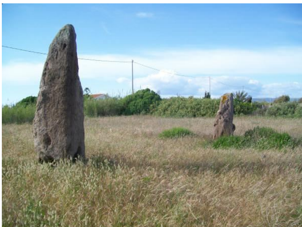
Fig. 1 - The Su Para and Sa Mongia menhirs.

Along the isthmus which connects the island of Sant'Antioco to the mainland you can see two menhirs erected during the late Neolithic period (3300- 2500 approx.), traditionally called Su Para and Sa Mongia (that is, "the monk" and "the nun"). It is said that they were the petrified bodies of two religious persons in love, caught by the divine curse which reached them during their flight (fig.1).