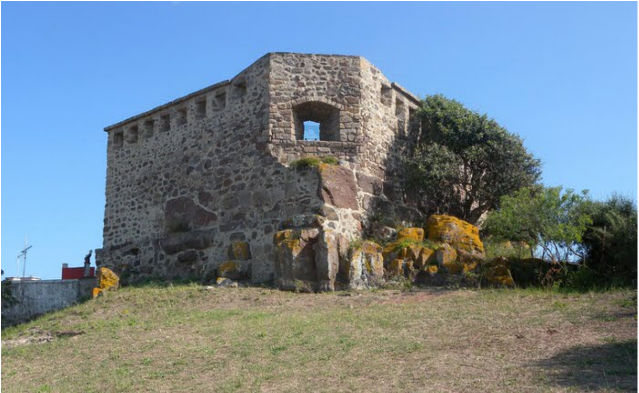
Fig. 3 - Su Pisu fortress, on top of the hill of the town of Sant'Antioco.

englobed by the walls of the Su Pisu Fortress during the eighteenth century of our era (fig. 3).