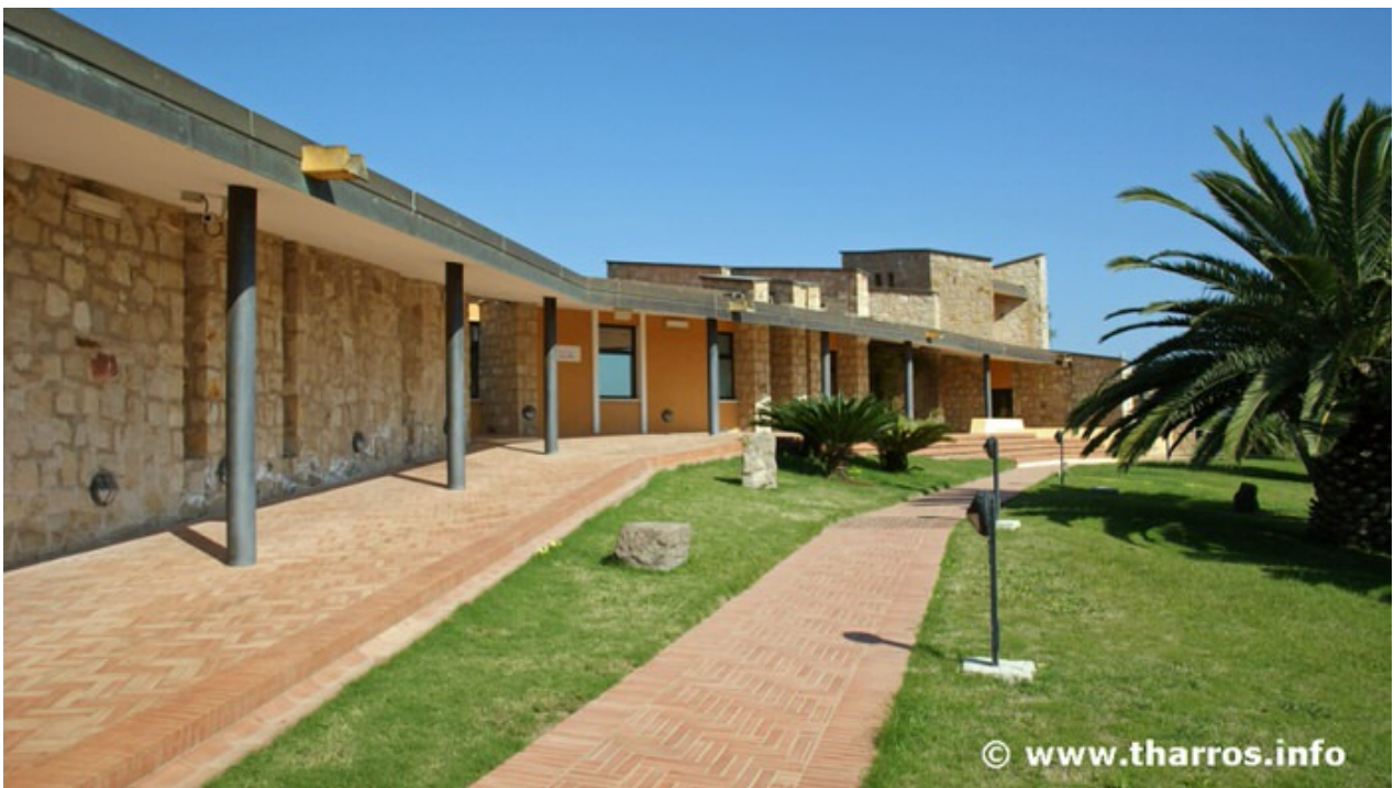
Fig. 3 - Outside view of the Municipal Archaeological Museum of Sant'Antioco.

Around the mid 1980s, the items found and stored in the temporary depot were partly placed in a temporary exhibitions in a room on the ground floor of Monte Granatico in the town, that was suitable renovated. In the meanwhile, at the beginning of the 1970s , the new museum was planned and in 1973, the building was constructed in an area next to the tophet , thanks to funds made available by the Cassa del Mezzogiorno . After various events and several changeovers of the building from one body to another, it was acquired by the Municipal Council in the mid 90s, and using funds from the Autonomous Region of Sardinia, managed to complete the building that was opened at the end of 2005, after being carefully fitted under the supervision of Piero Bartoloni (fig. 3). The museum was named after F. Barreca, who was the creator of the very first centre.