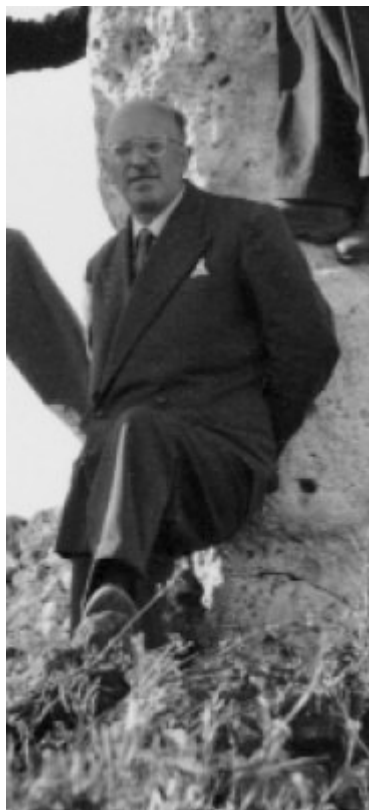
Fig. 1 - Gennaro Pesce in an image from 1942 (detail from http://it.wikipedia.org/wiki/File:Sassari_-_Menhir_di_Monte_d%27Accoddi,_1942.jpg )

Excavations began in Sant'Antioco, the ancient Sulky , in the area of the tophet and of the underground necropolis in 1956. The digs were carried out by the Superintendent of Antiquities in Cagliari of the time, Gennaro Pesce (fig. 1) and Inspector Ferruccio Barreca (fig. 2) in collaboration with the main assistant Peppino Lai.