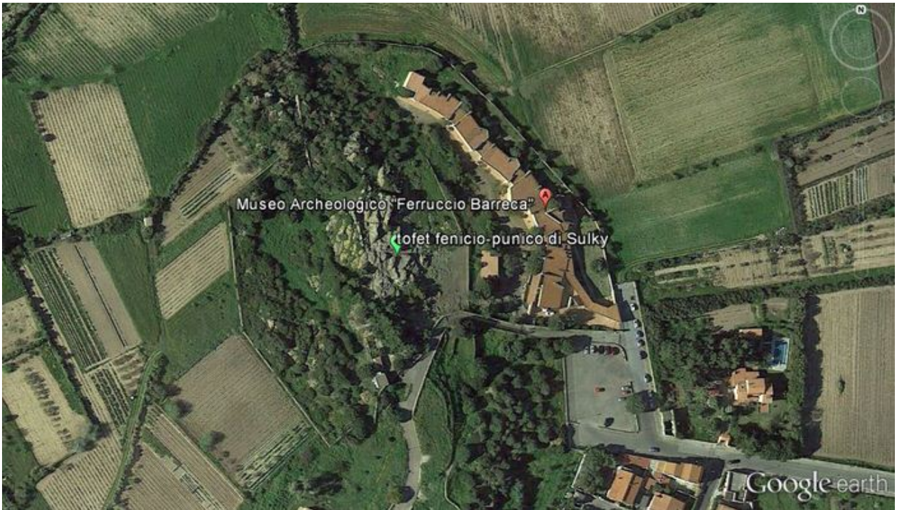
Fig. 5 - The Archaeological Museum seen from above. To the left of the building, the Tophet.