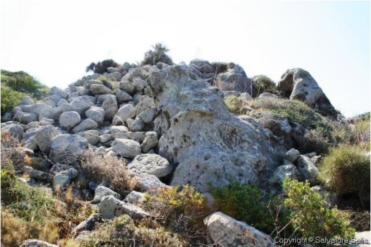
Fig. 4 - Remains of the Nuraghe Grutti Acqua