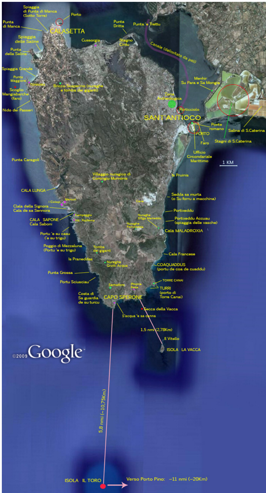
Fig. 3 - Map showing the different names and Nuraghe in the area (from http://www.lacanas.it/2012/02/21/un-sistema-nuragico-di-dimensioni-gigantesche-con-tanto-di-laghetto/ )