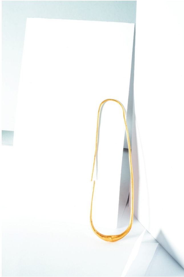
Fig. 2 - Leech earring from tomb 9 AR of the necropolis in Sulky. Municipal Archaeological Museum "F. Barreca"

The type of leech earring is rather common in Punic Phoenician gold jewellery, and they can be of a simple shape, or decorated with some details, such as pendants (figs. 3-4) or applications of a different type, including the ones obtained using filigree and granulation techniques (fig. 5) that are more rare among the items found in Sulky.