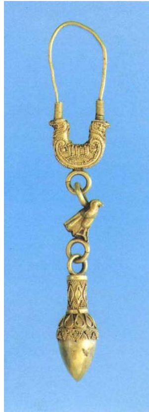
Fig. 5 - Earring in gold filigree and granulation from Tharros. National Archaeological Museum of Cagliari (from Quattrocchi Pisano 1974, table I, fig. 1).

The development of this class of materials, with the possibilities offered by trading of metal along Mediterranean routes, is linked to an artistic tradition that was rich and successful for centuries in the Phoenician motherland. In Sardinia, the evidence from Tharros so far appears to be the largest and most important because of the quality and quantity of the jewellery as well as of the other athyrmata (bric-a-brac). It is hard to say whether the Sulky ring was forged in a workshop in Sulky or whether it hails from the well-known ones in Tharros, or even from Phoenicia. The doubt in question comes from the evidence of a substantial homogeneity and conservatory nature of this kind of production that makes it difficult to distinguish between items made in the East and those in the West. The hoarding of jewels that could be kept for several generations, always being used, limits the possibility of precise chronological definition, as even when found in easily datable archaeological contexts, it isn't possible to deduce the period of actual production, but only that of use.