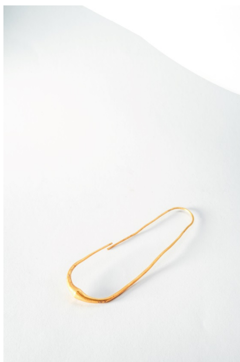
Fig. 1 - Leech earring from tomb 9AR of the necropolis in Sulky. Municipal Archaeological Museum “F. Barreca”

The earring (7.3 cm long) has a body made of tubular gold metal, in an oval shape, that narrows towards the end: it is a very simple item that compared to other leech earrings that are slightly swollen in the centre, this one has two small cones joined together for the base (figs. 1-2).