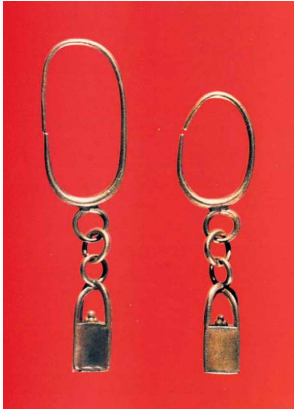
Fig. 3 - Drop earrings in the shape of a basket, from Tharros. National Archaeological Museum of Cagliari (from Acquaro 1984, p. 20, fig. 7).