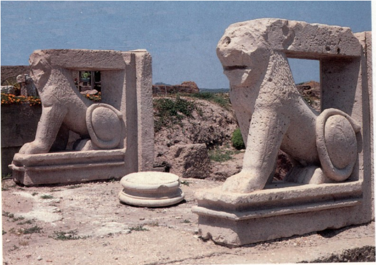
Fig. 6 - The lions of Sulci now at the archaeological museum F. Barreca immediately after the discovery (from http://www.archeotur.it/santantioco/immagini/category/3-museo-archeologico.html ).

Between 1985 and 1988, C. Tronchetti and Paolo Bernardini continued excavations in the same area of the necropolis, called AR, which had already been investigated in 1982-1983, and several Punic tombs were brought to light, including tombs 7, 9, 10, 11, 12 AR14.