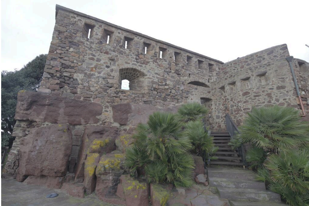
Fig.1 - Savoy stronghold of Su Pisu.

Those same underground tombs were later reused during the Roman and early Christian ages and partly exploited, at least since the eighteenth century, as housing by the lower classes of Sant'Antioco which, as the oldest part of the town became repopulated, were dangerously exposed to the risk of pirate raids (2). No systematic and organised survey of the territory has been carried out as a significant part of the necropolis today lies under the modern town. On the basis of the knowledge deriving from a century of archaeological research, it is now possible to hypothesise that the original extension of the burial complex exceeded 6 hectares and that it included not many less than 1500 graves (3) (figs. 2-3).