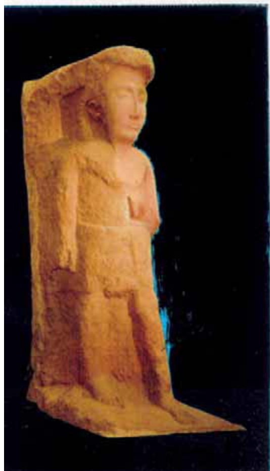
Fig. 7 - High relief of burial tomb no. 7 in the necropolis of Sant'Antioco, discovered in 1968 (From TRONCHETTI 1989 Fig. 3, p.10).

skirt, bracelets, kluft and beard, similar to the one found in 1968, which until a few decades ago was proudly displayed at the old National Archaeological Museum of Cagliari (fig. 7).