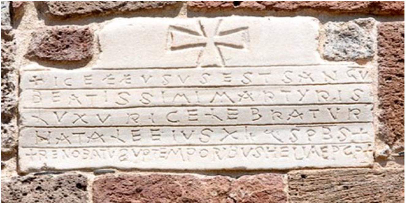
Fig. 2 - Inscription dated VI century in memory of the martyrdom of Luxurius.

Digs have brought an inscription (fig. 2) to light, now walled in the church wall, recalling the Saint's martyrdom, called "blessed martyr", placed by the Bishop Elia; based on its characters this inscription is dated VI century A.D.