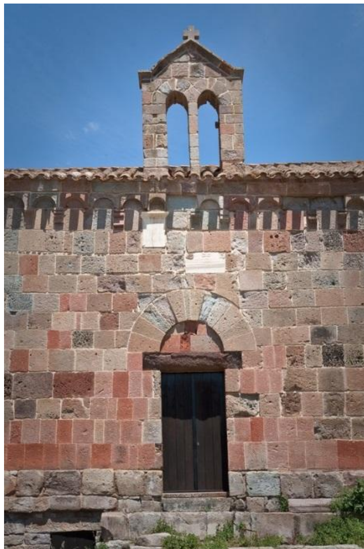
Fig. 1 - Southern front of the small church of San Lussorio, built in the XII century and rebuilt the following century, after a collapse.

Its main interest is the presence of the martyrium of Luxurius, martyred under Diocletian at the start of the IV century A.D.; this cult was definitely present in Sardinia in the VI century A.D. (fig. 1). A church dedicated to him was later built on the place of his martyrdom.