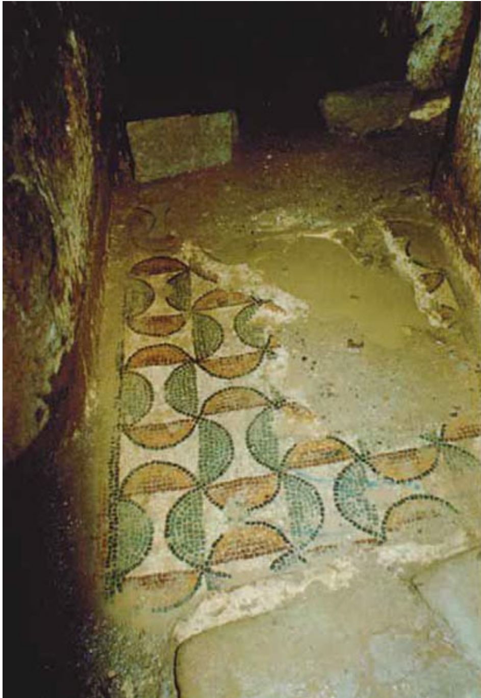
Fig. 4 - Mosaic floor of the crypt in San Lussorio (from Zucca 1986).

During the VII century the buildings degraded and were replaced by a small church, which also fell into ruin. The current building was built by the Vittorini Monks from Marseille at the start of the XII century and was then rebuilt after it collapsed.