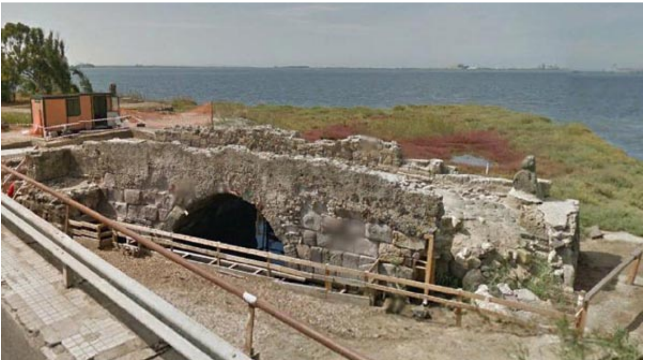
Fig. 1 - Remains of the Roman brge over the Tirso at the height of Santa Giusta, ancient Othoca

There are numerous bridges crossing the rivers. Many of them have been used until modern times, with continual renovation and adaptations (figs. 1-3); so it is hard to see which structures date back to Roman times.