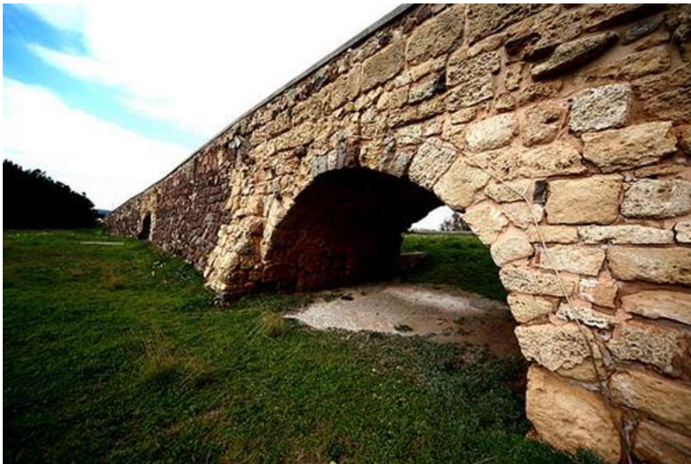
Fig. 3 - Sant'Antioco, bridge built on the remains of a Roman bridge