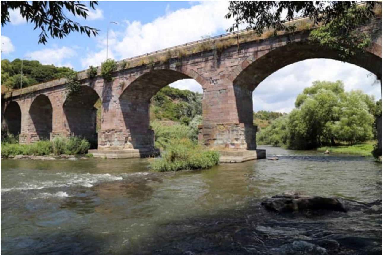
Fig. 4 - Bridge over Tirso at Fordongianus: the modern pillars are set on the base of the ancient Roman bridge.

In the case of the Fordongianus bridge (fig. 4), the base of the pillars appears to have been made in opus quadratum , like the Baths I structure. So the bridge is presumed to have been built at the same time as the Baths; part of a process to renovate the centre in the Trajan period.