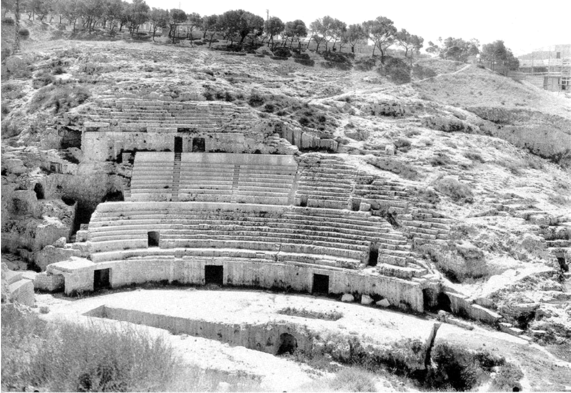
Fig. 3 - The Roman amphitheatre of Cagliari, dug in the rock.