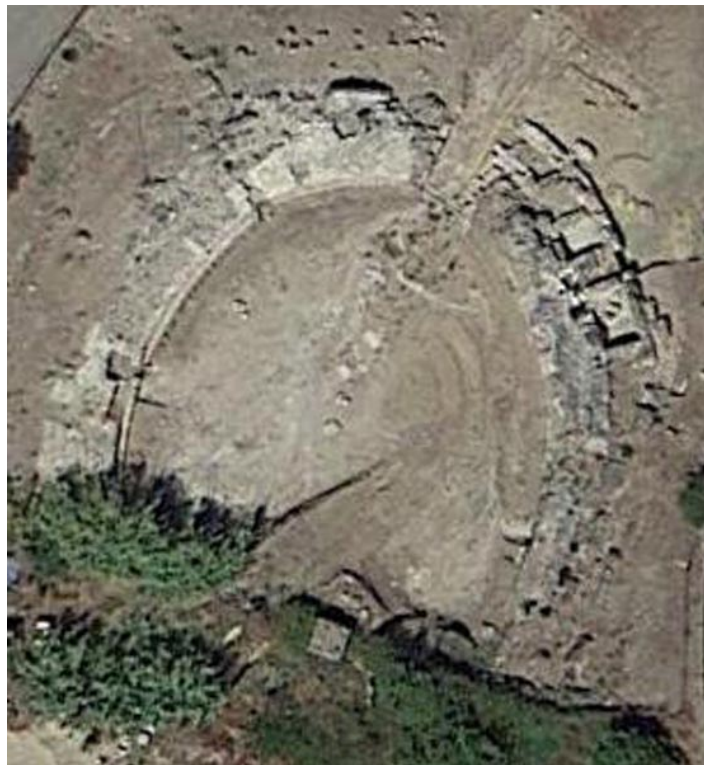
Fig. 1 - Picture of the amphitheatre of Fordongianus during the dig.

The amphitheatre of Forum Traiani is located in a small valley called Apprezzau, in an outlying position moved slightly further South compared to the Roman town (figs. 1-2).