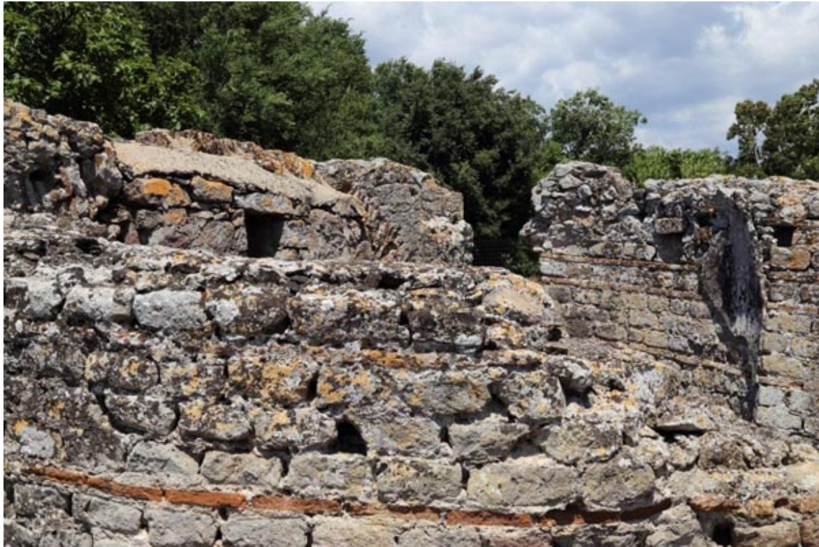
Fig. 4 - Detail of the opus vittatum mixtum building technique

Before finding the Nymphaeum next to the natatio this structure was considered the Nymphaeum. But this is no longer considered the case and its function still needs to be clarified. With no dig data and considering the considerable restructuring done on the part up until modern times, the only element enabling us to date it is the building technique used placing it alongside the Baths II chronologically.