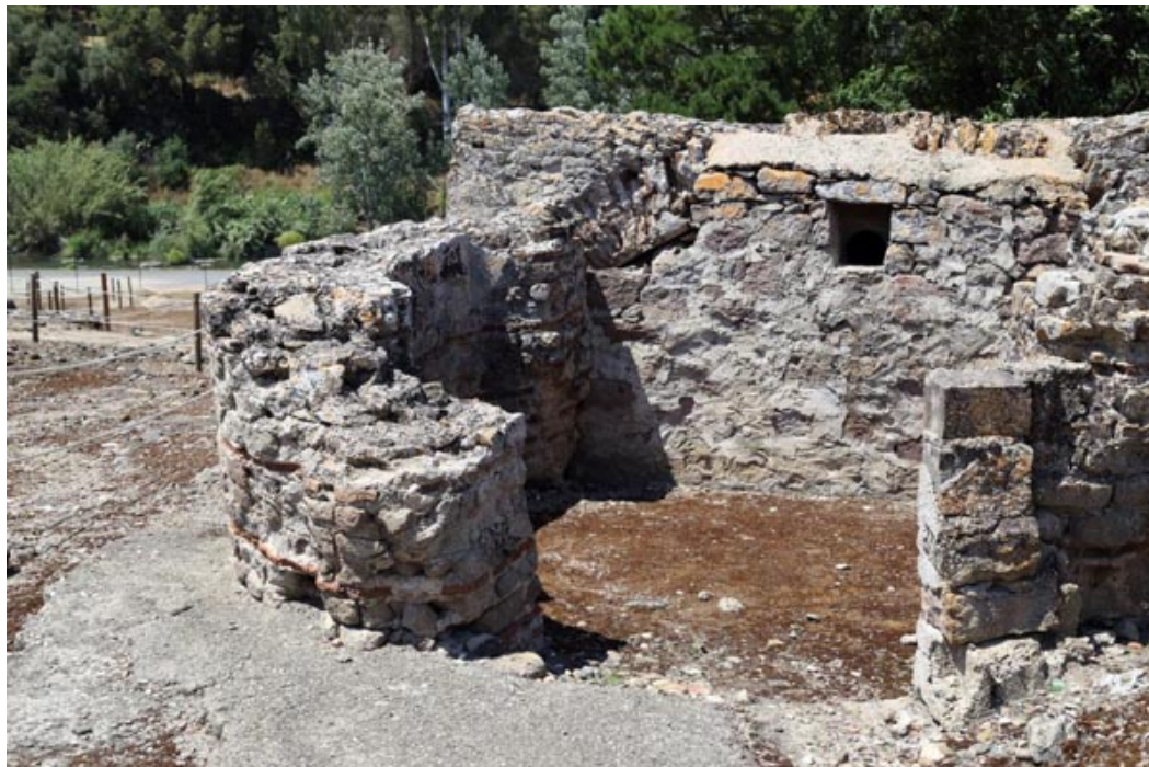
Fig. 3 - View of the building from the South, showing the apsidal room

The area is rectangular with a small apse (fig. 3) on the South side, and has a small bath.