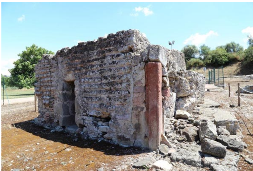
Fig. 2 - Building considered a Nymphaeum, restructured until modern times

The area is rectangular with a small apse (fig. 3) on the South side, and has a small bath.