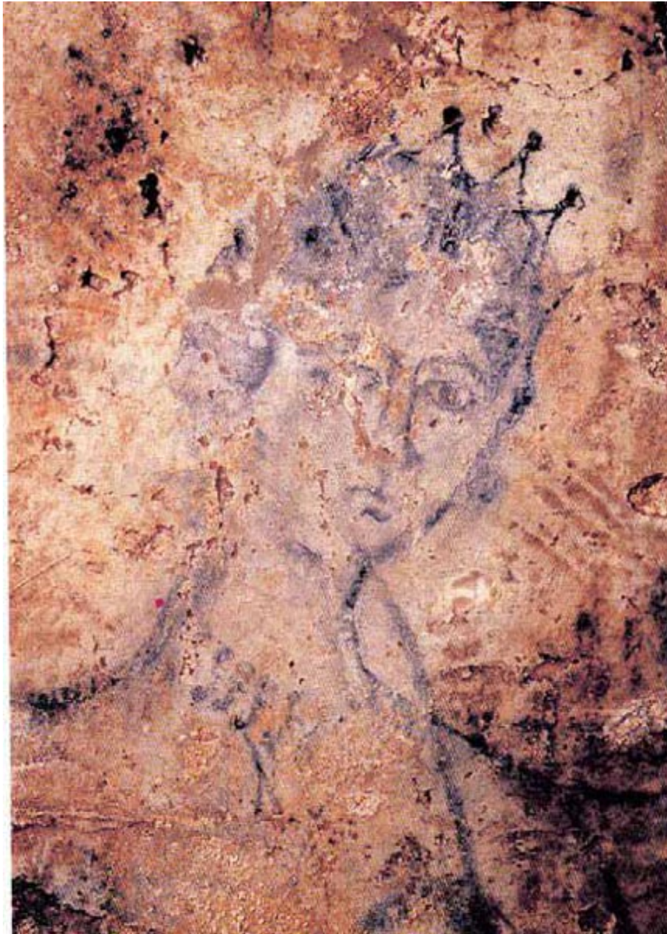
Fig. 4 - Hypogeum of San Salvatore di Cabras (OR). Face of Venus (from Donati-Zucca 1992, p. 29)