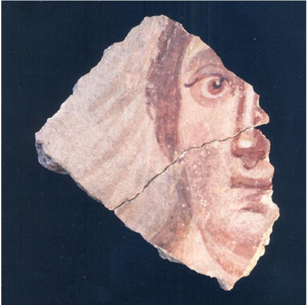
Fig. 3 - Cagliari, Villa of Tigellio: female face (from Angiolillo 1987, fig. 120)

There is more evidence in the cultural environment, with the portrayal of a series of sacred items in the hypogeum of San Salvatore di Cabras (fig. 4).