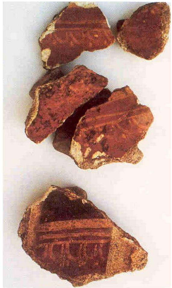
Fig. 2 - Nora. Remains of a painted decoration in a house of the III cent. A.D. (from Ghedini, Salvadori 1996 tab. I)