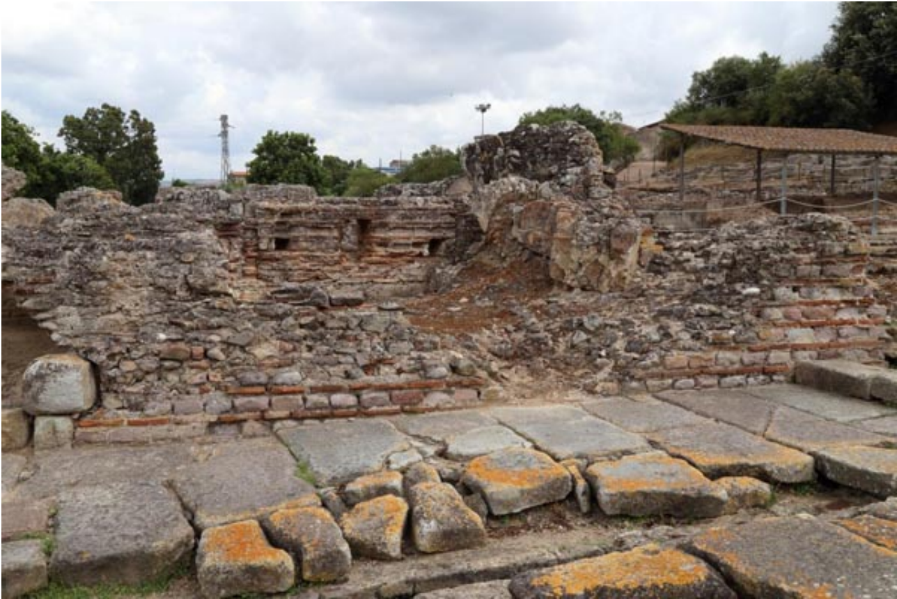
Fig. 4 - L-shaped Building: home seen from the square

It is not possible to know the function of these buildings with certainty; it has been hypothesised that a part of them were used as accommodation for the thermal bath users, but there is no proof of this. It is certain, however, that the southern side included dwellings that are no longer visible above ground, that can be reconstructed based on data from better preserved sites, such as Pompeii and Ostia (figs. 5-6)