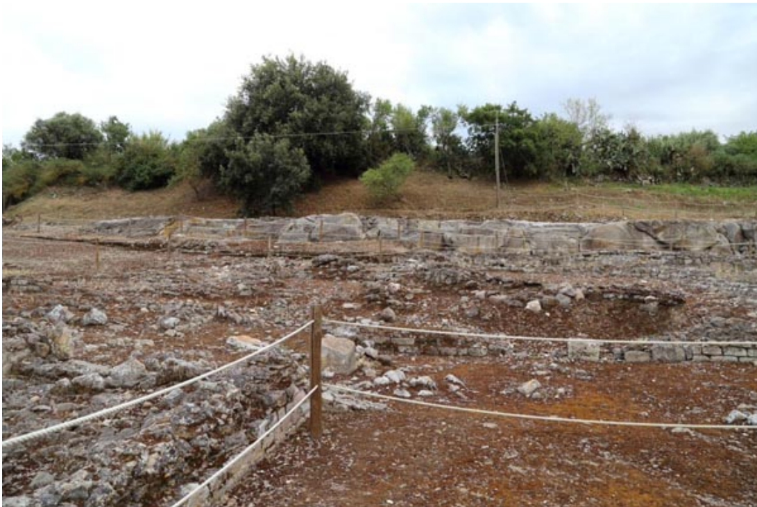
Fig. 3 - L-shaped Building: remains of a probable home

On the southern side, on the other hand, the rooms are arranged in a more complex structure (figs. 3-4)