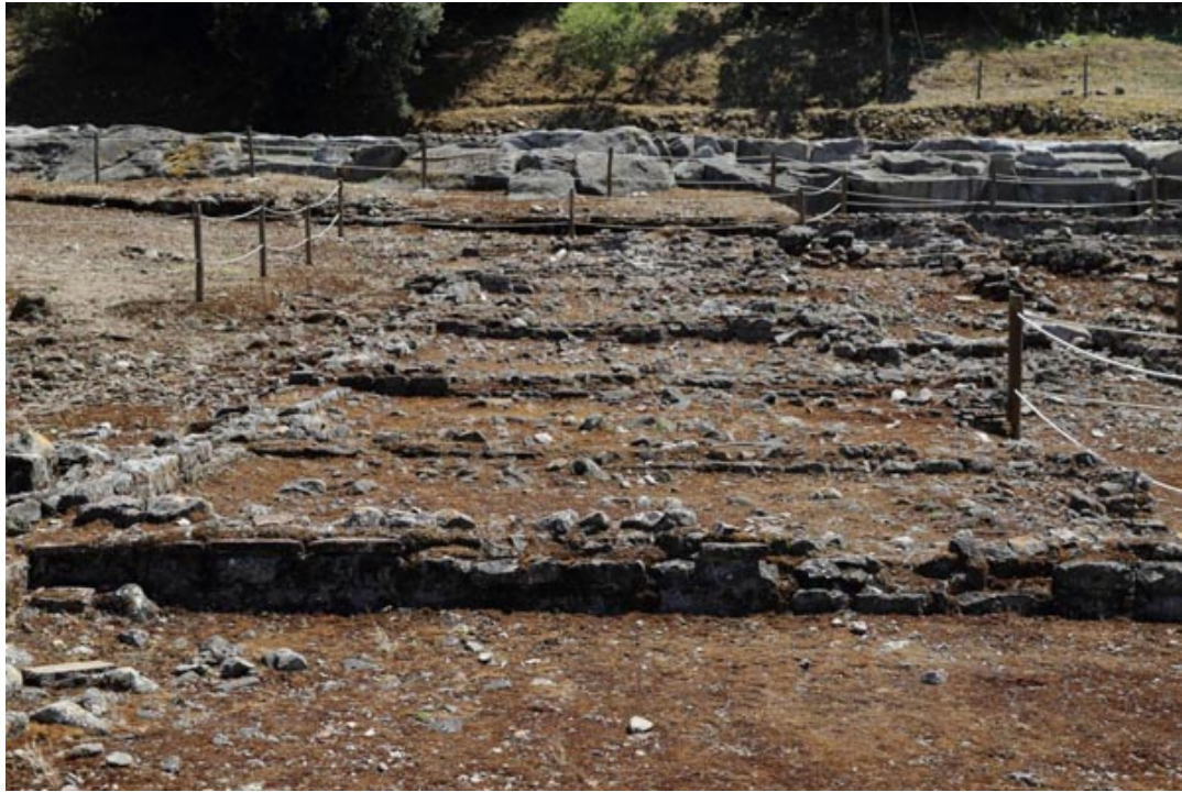
Fig. 2 - L-shaped Building: rooms aligned along the corridor.

On the southern side, on the other hand, the rooms are arranged in a more complex structure (figs. 3-4)