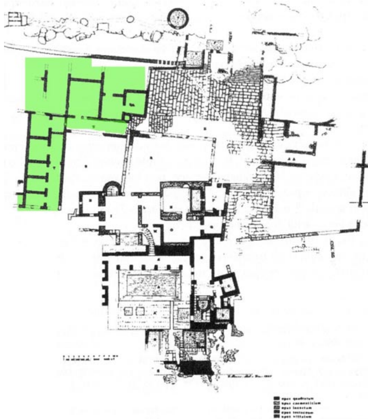
Fig. 1 - In green the L-shaped Building (from Bacco, Serra 1998, re-worked by C. Tronchetti).

To the South-East of the Baths there is an L-shaped building (fig. 1) whose corridors delimit the open space called 'gym'.