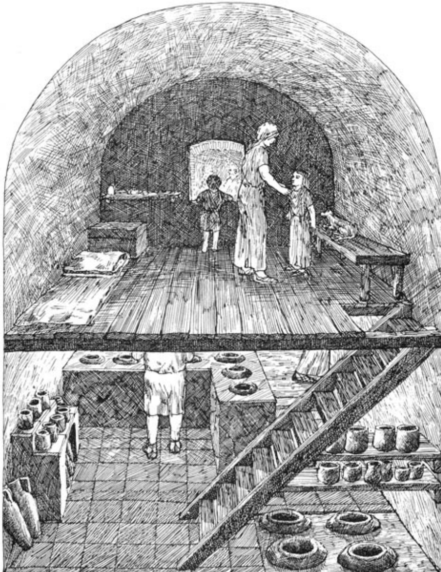
Fig. 5 - Reconstruction of a Roman home-shop: the lower floor was used as a shop and the upper part as a home (from Macaulay 1978, p. 107).