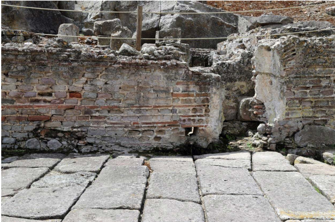
Fig. 5 - The wall closing the square on the southern side