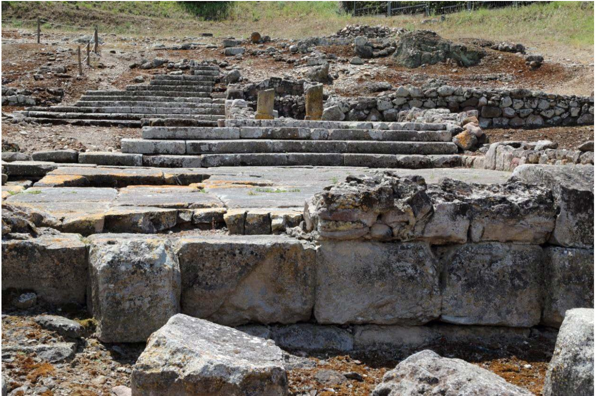
Fig. 4 - Western sector of the square, with a short flight of steps going towards the level of the Tirso river

Canals carrying hot and cold water towards the Baths run in the paved flooring.