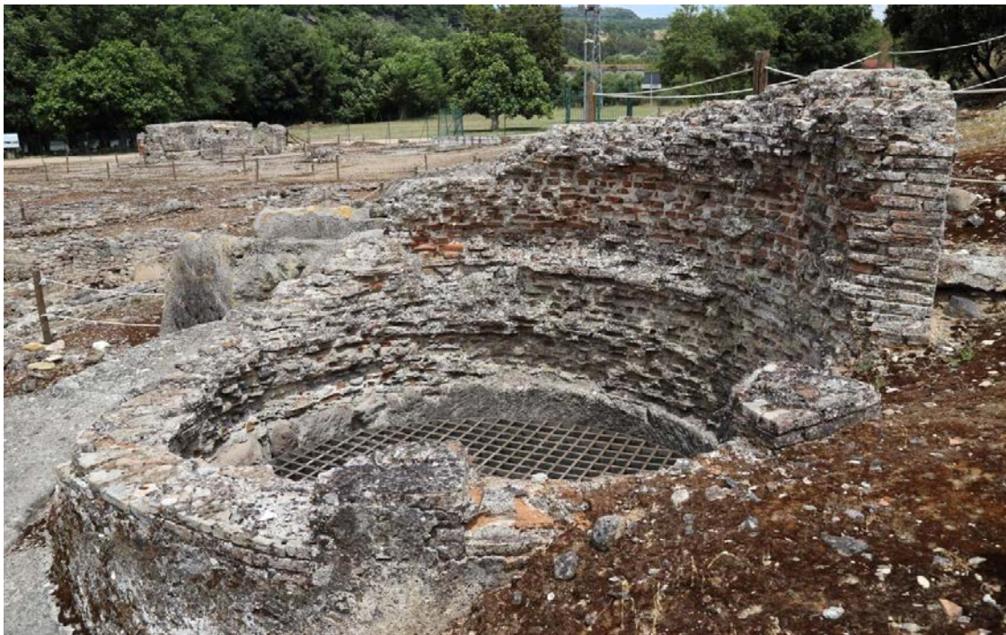
Fig. 6 - Large cistern above the square

This square, considering its size and the care taken over building it, is hypothesised as the forum of Forum Traiani .