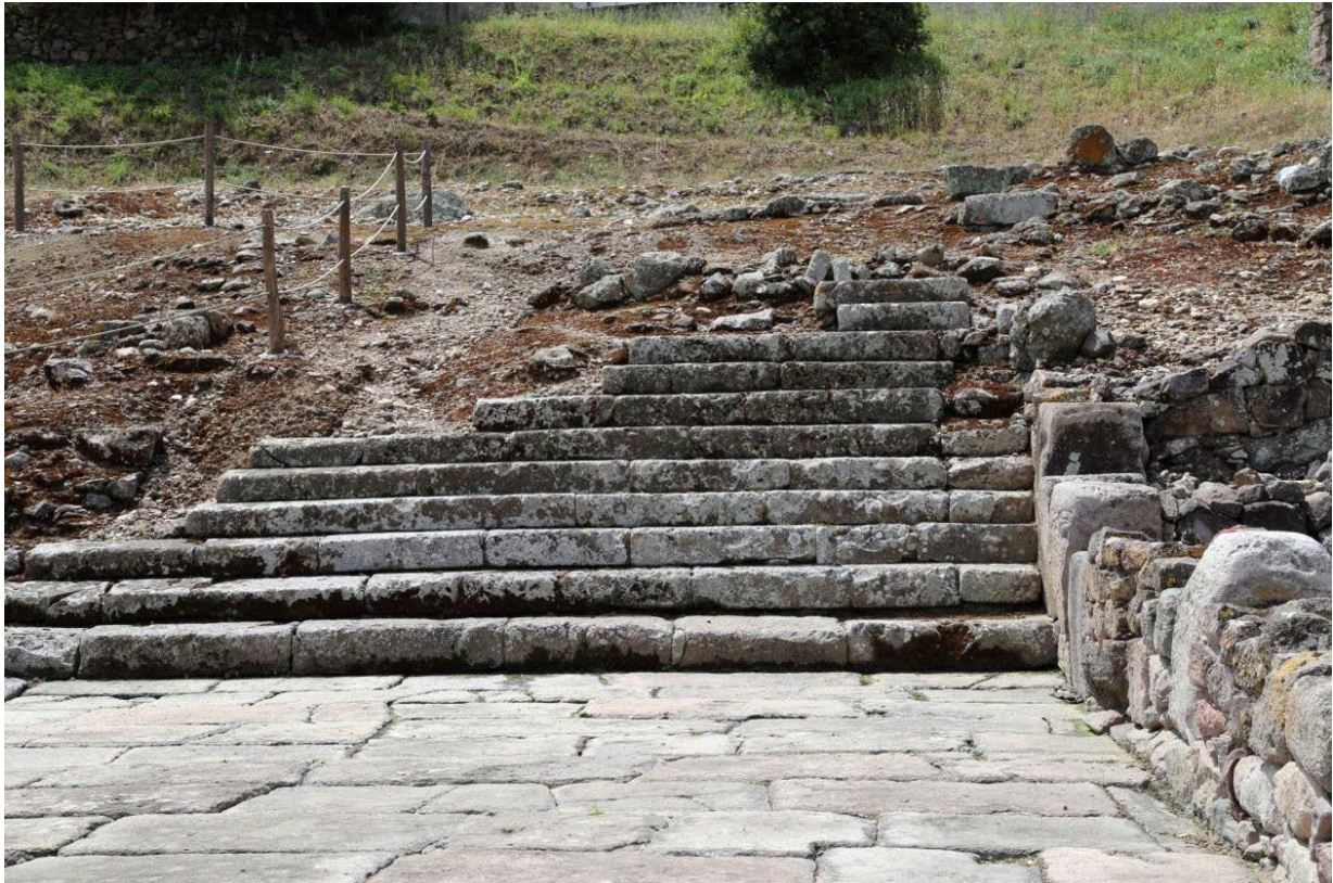
Fig. 3 - The square and stairs leading to the habitat

To the West, the square narrows and lengthens; here too some steps get over the difference in level going down towards the river (fig. 4).