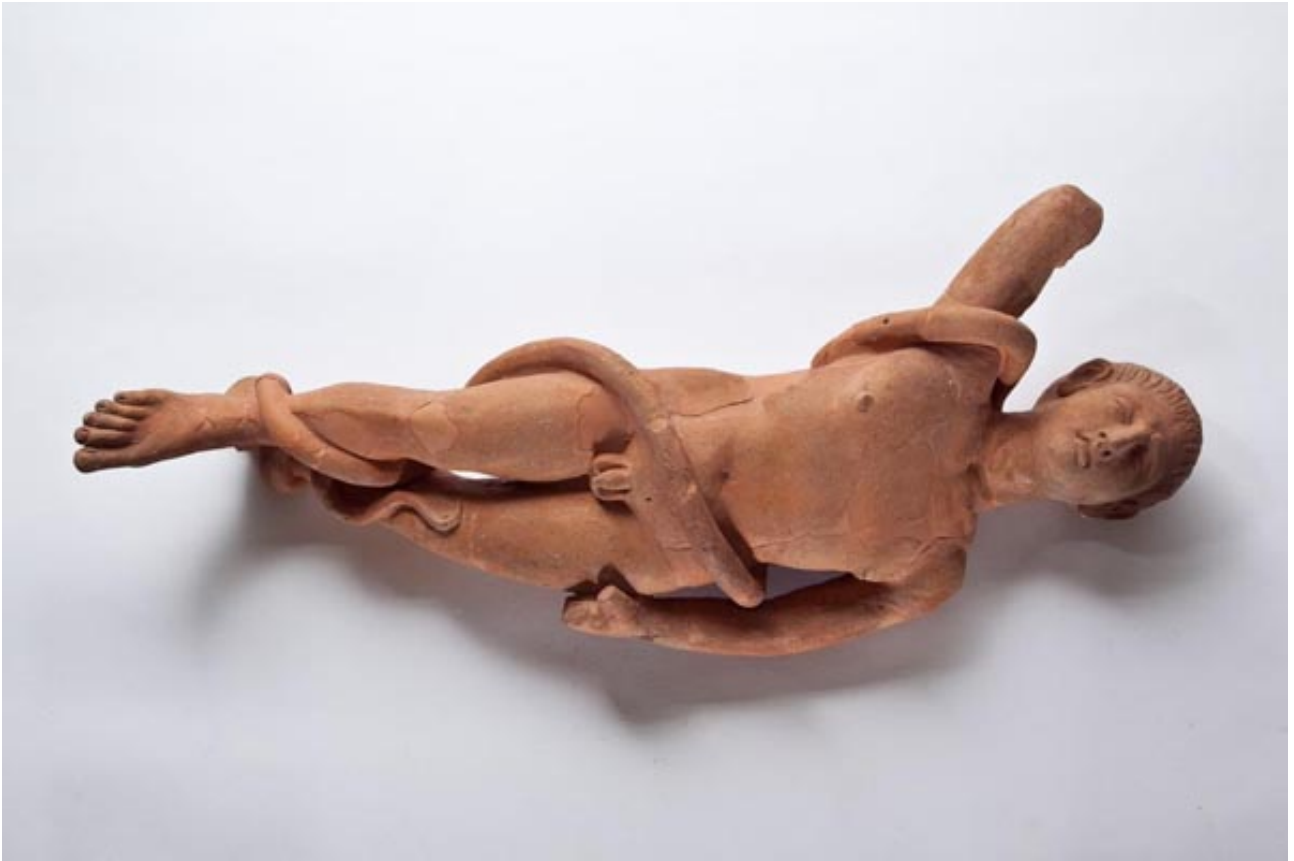
Fig. 2 - Small devotee statue from Nora, sanctuary of Asclepius. The sick person is portrayed sleeping, wrapped in the coils of a serpent, sacred animal of the god.

The offerings are often simple and at times rough, small, terracotta statues, with the hands indicating the part of the body for which healing is being invoked (figs. 3-4).