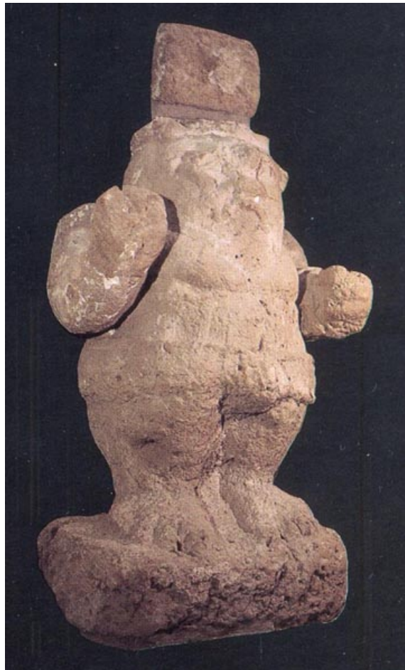
Fig. 1 - Statue of Bes from Bithia, linked to a sanatio cult. (from Barreca 1986, p 137)

In Fordongianus, worship of nymphs, generally linked to water, also takes on a health meaning, obviously thanks to the curative properties of the thermal spring. The presence of inscriptions dedicated to the Nymphs and Asclepius, god of health, supports this. It enables us to add Fordongianus to the list of Sardinian locations linked to the cults of sanatio , healthiness, existing from the late-Punic and Republican period, between the III and II century B.C.. At times connected to Baths, like in Mitza Salamu di Dolianova; at others they are in an objective curative context and are just simple places of worship normally dedicated to the god Bes/Asclepius, like at Bithia (fig. 1) and Nora (fig. 2).