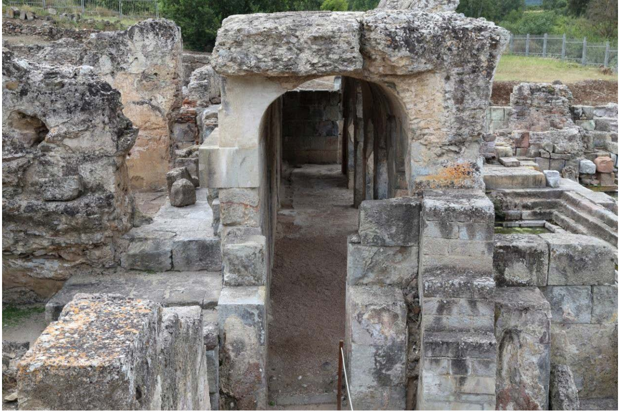
Fig. 4 - View of the portico from the East.