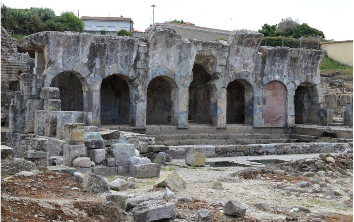
Fig. 2 - The southern portico of the pool.