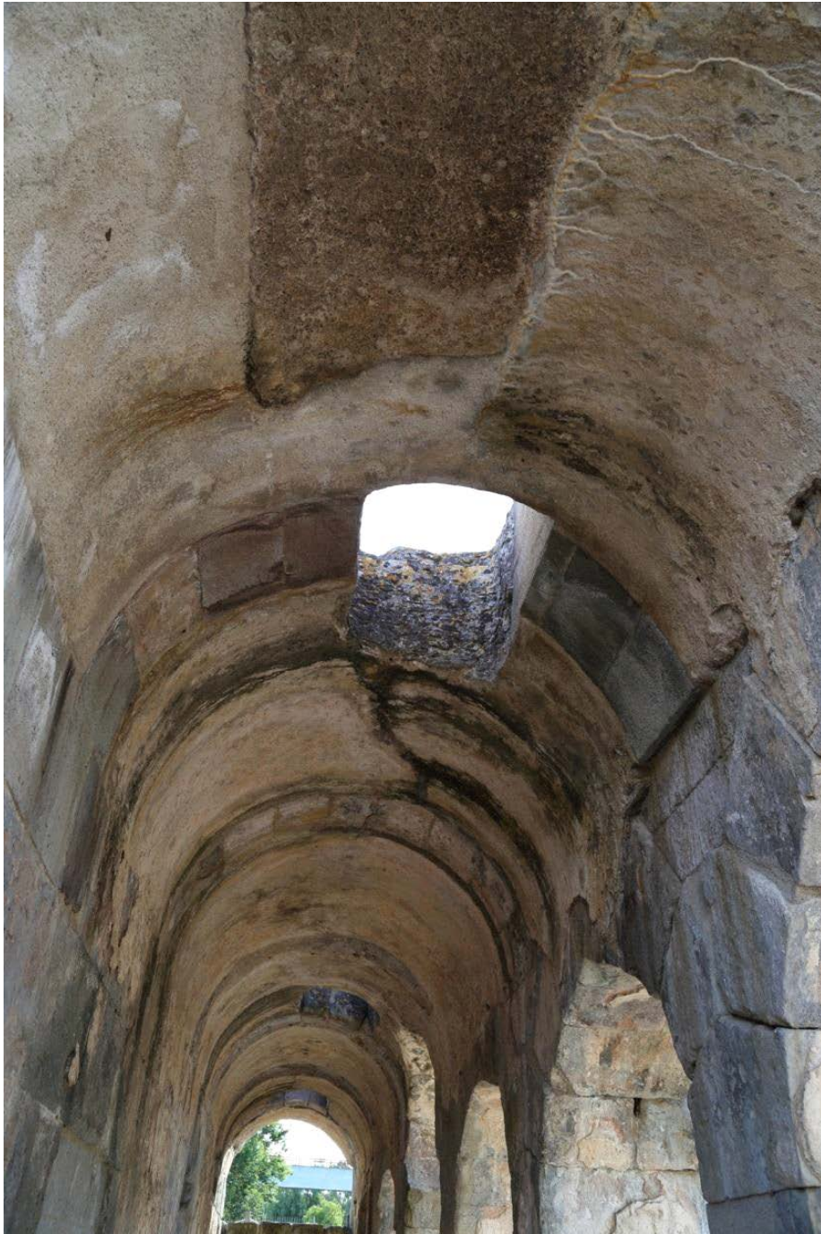
Fig. 5 - Portico roof with skylights for lighting.