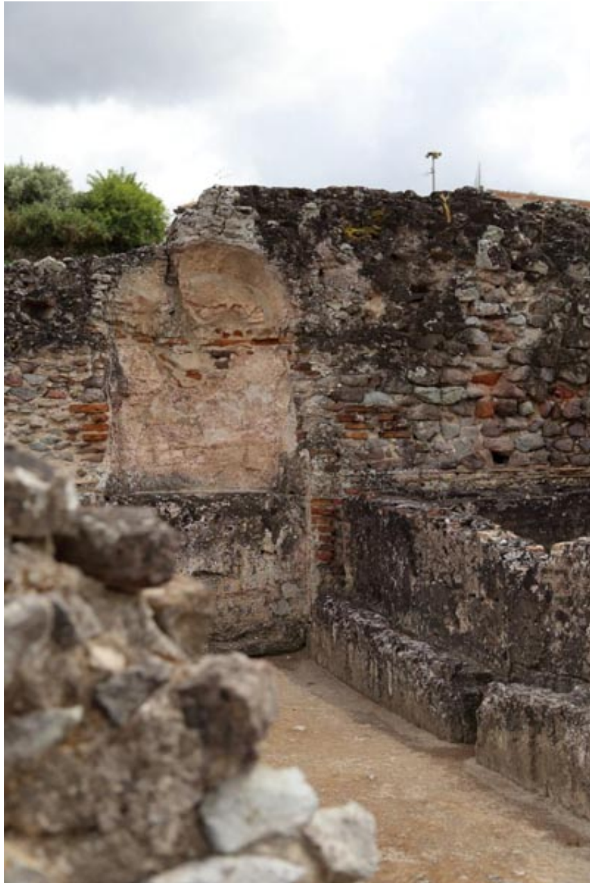
Fig. 4 - View of the calidarium with bath and niche.