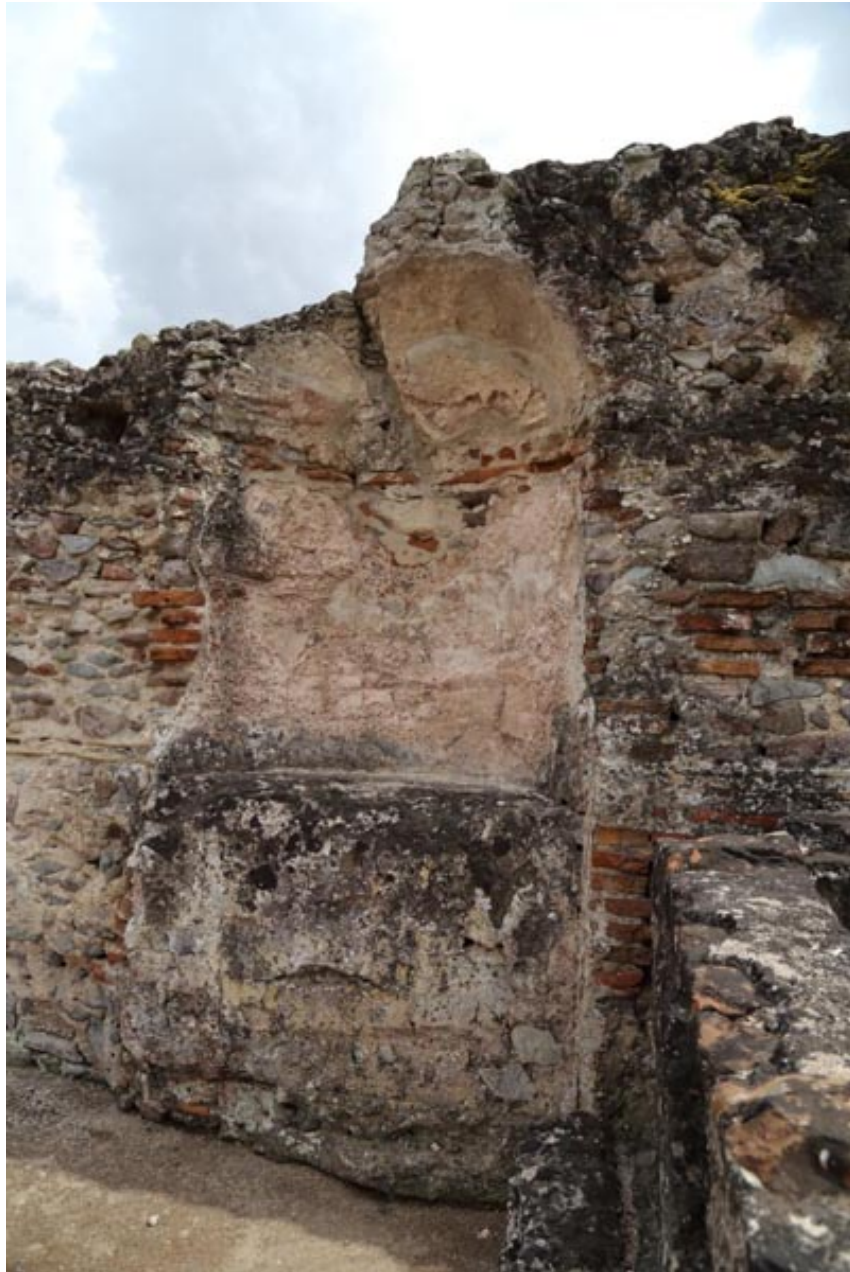
Fig. 5 - The niche next to the bath; intended to contain an ornamental statue.