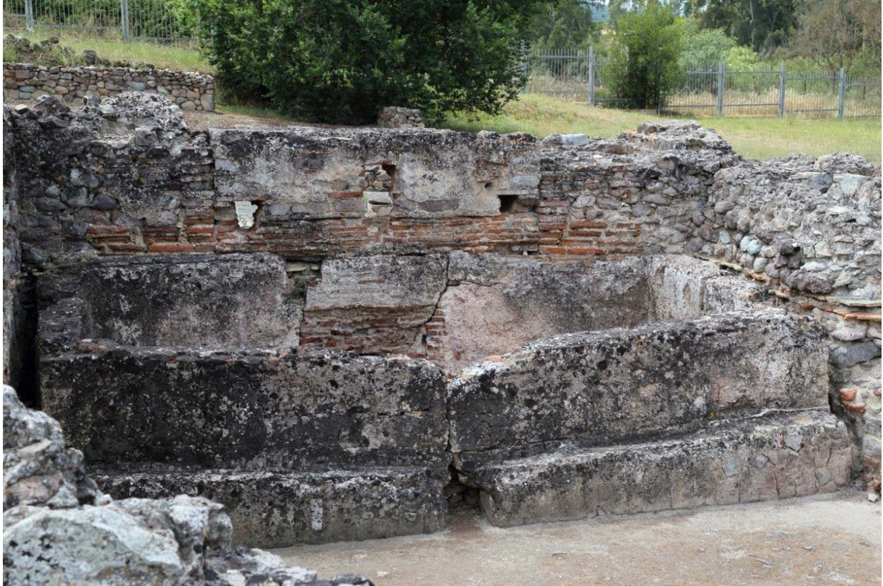
Fig. 2 - Bath in the calidarium (photo by Unicity S.p.A.).

The calidarium in the Fordongianus Baths is badly preserved; but can be identified through the rectangular bath (fig. 2) which held the tepid water used to cool down with; cavity tile remains are visible to the sides (fig. 3).