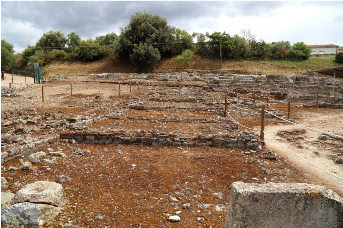
Fig. 3 - View of the spaces adjacent to the gym