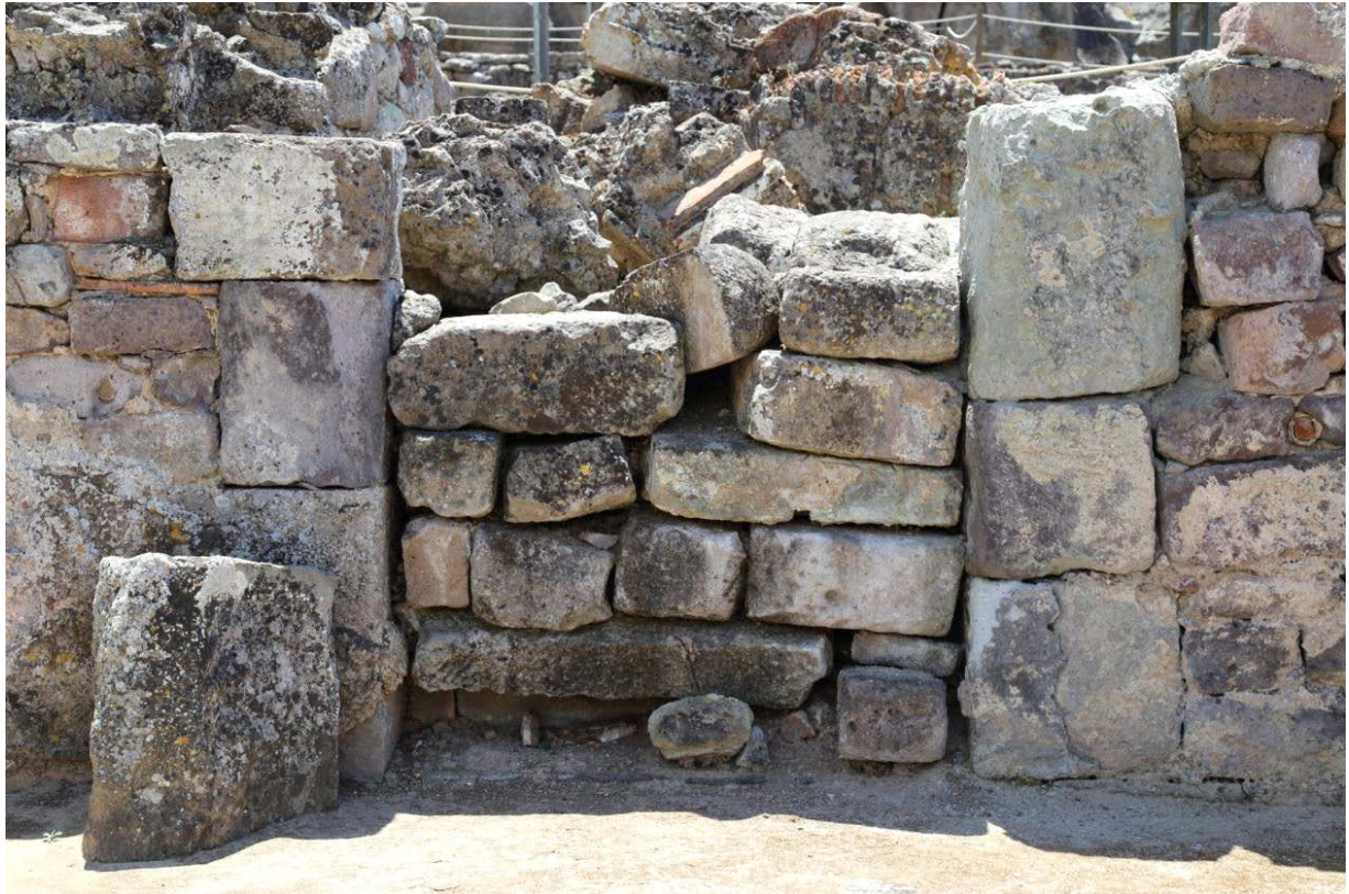
Fig. 2 - Entrance to the baths from the courtyard

frigidarium (fig. 2). It is also a passage-way to another open space to the east (fig. 1, in blue).