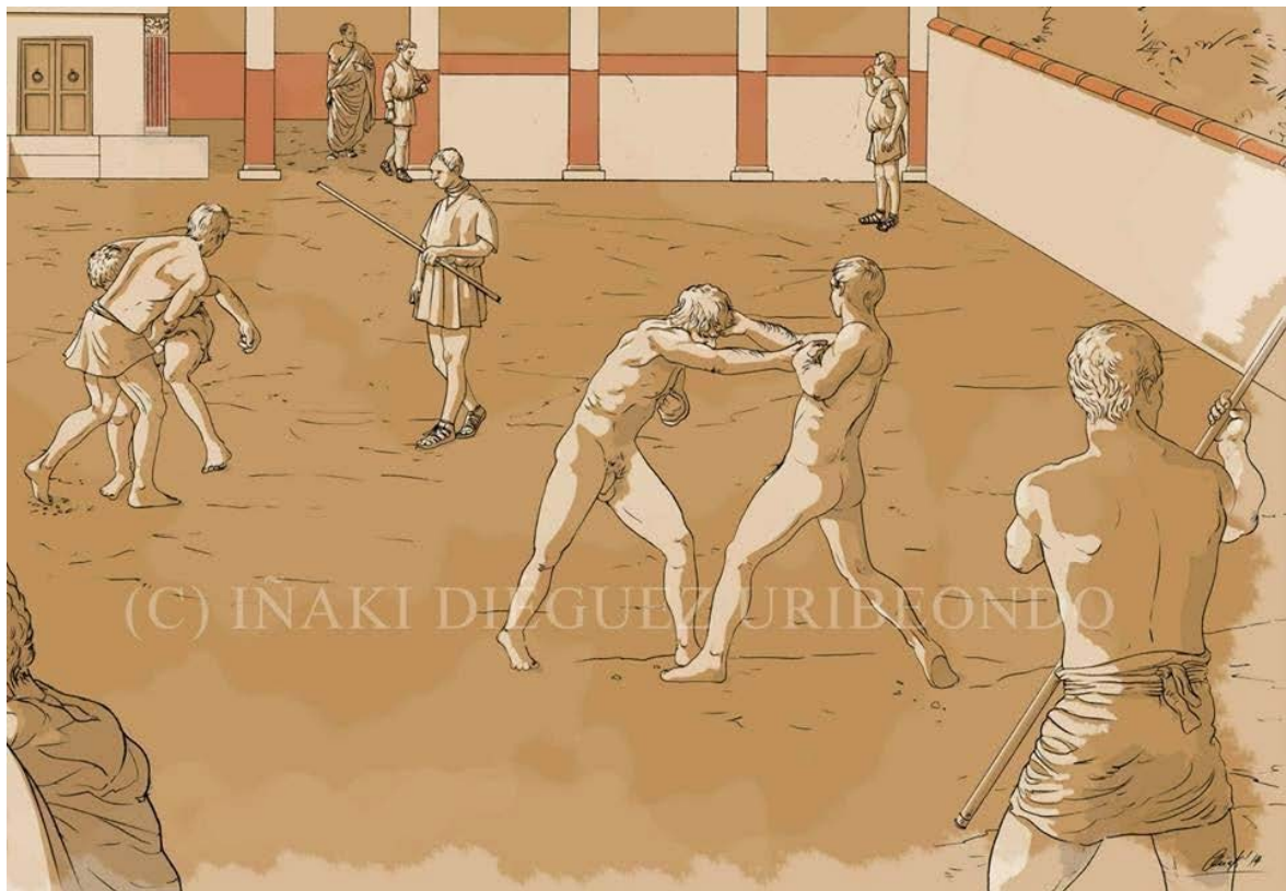
Fig. 4 – Reconstruction of the Roman baths gymnasium of Sebastium , at Vitoria Gasteiz in Spain (from Facebook “IDU. Ilustración y Dibujo arqueológico”, illustration by Iñaki Diéguez Uribeondo).