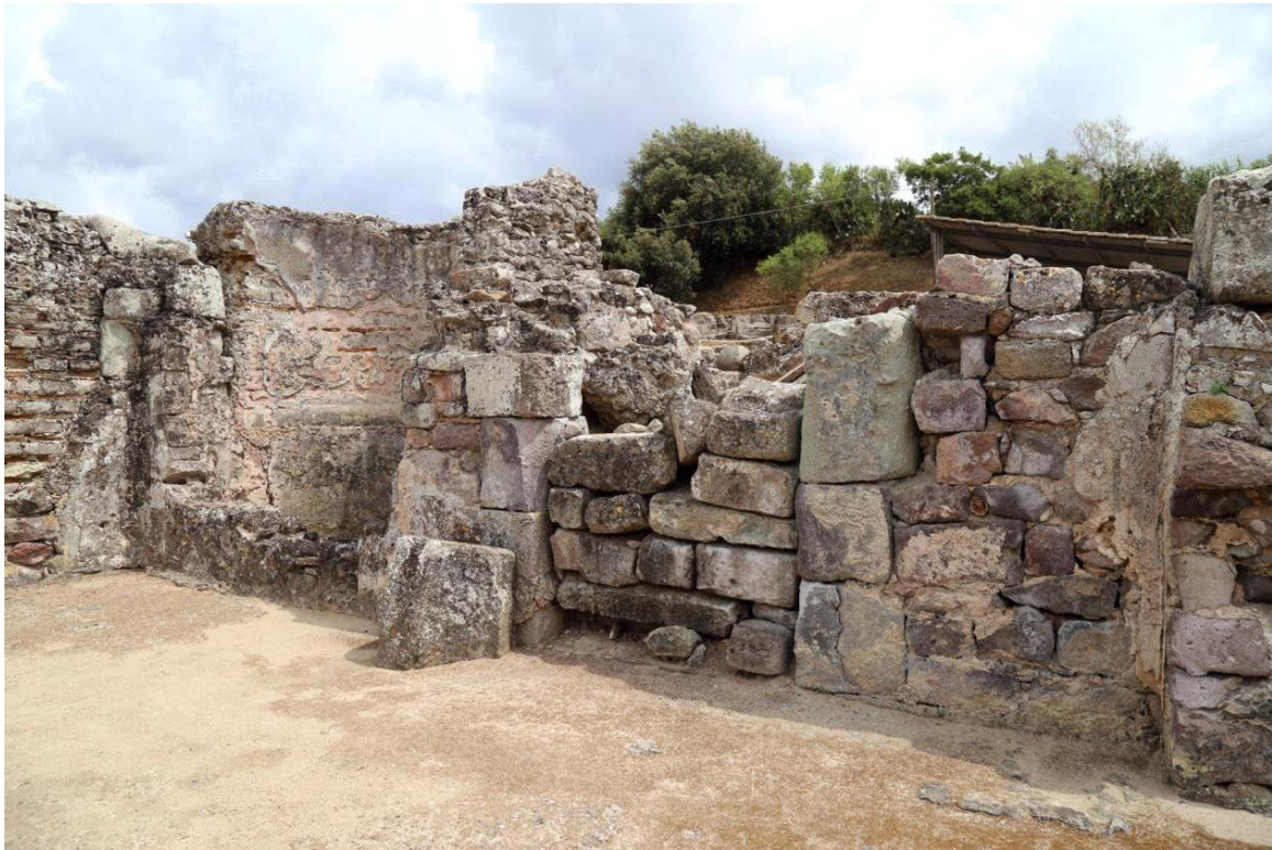
Fig. 2 - Entrance to the frigidarium (photo by Unicity S.p.A.).

by the large door that was closed in the Late Antiquity period (fig. 2). The room has two small baths, one rectangular and the other semi-circular (figs. 2-4), both not that big.