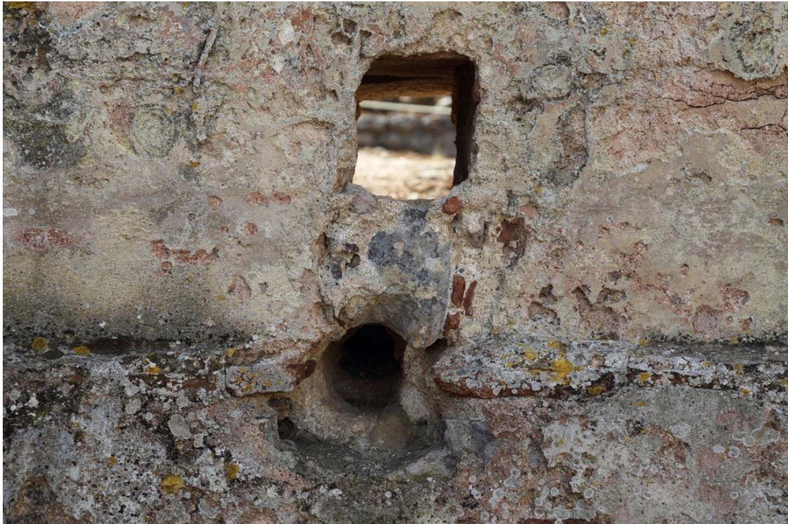
Fig. 5 - Detail of holes in the wall where the water was channelled (photo by Unicity S.p.A.).