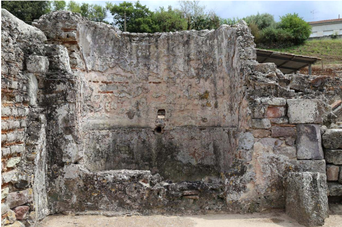
Fig. 3 - Semi-circular bath.