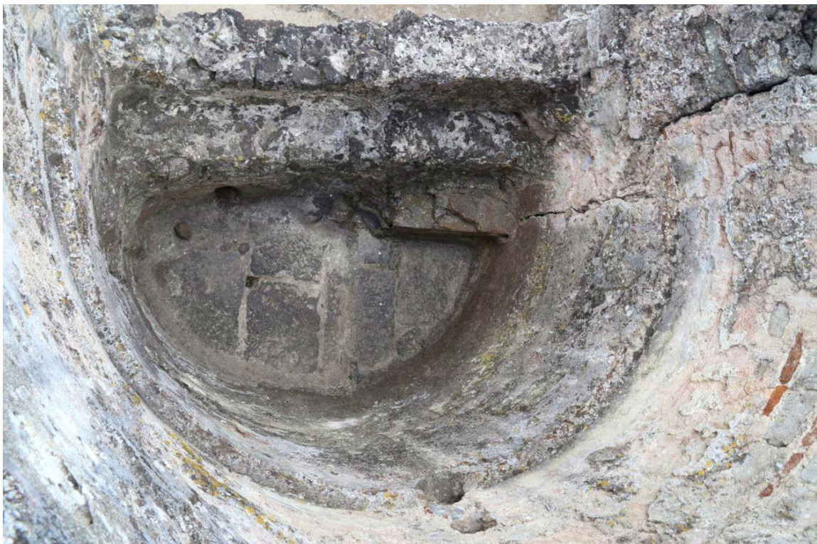
Fig. 4 - Detail of the bath with steps.