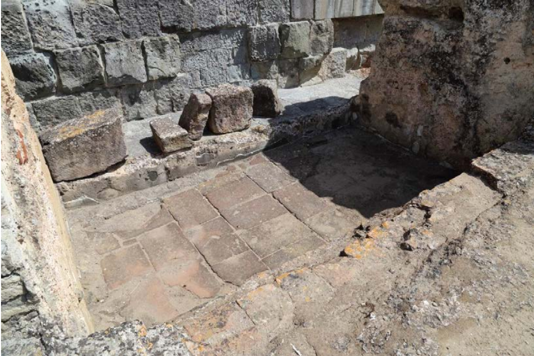
Fig. 4 - Bath of the frigidarium in baths II.

Then, through the tepidarium , you entered two calidaria , one of which equipped with a small bath with heated water (fig. 5). On the western side, the service areas with ovens.