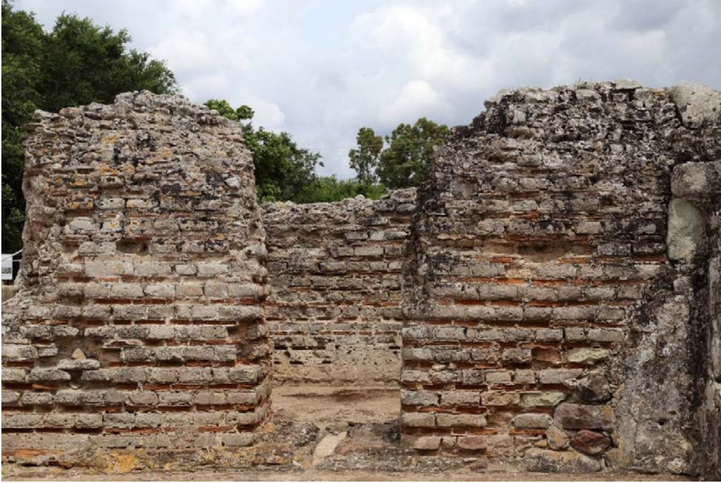
Fig. 2 - Passage from the frigidarium to a space used for an unknown purpose, perhaps a changing room.