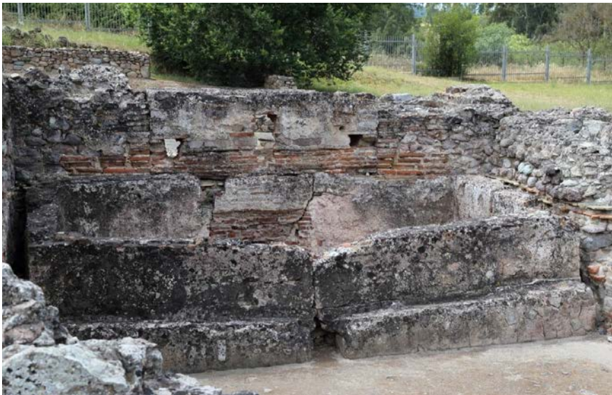
Fig. 5 - Bath in the calidarium.

Then, through the tepidarium , you entered two calidaria , one of which equipped with a small bath with heated water (fig. 5). On the western side, the service areas with ovens.