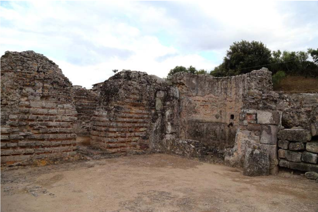
Fig. 3 - Detail of the frigidarium of baths II, with a small apse tank.