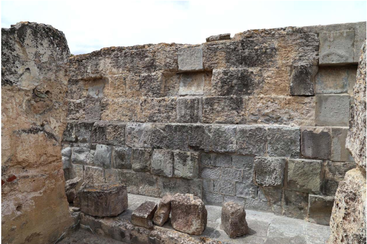
Fig. 2 - The imposing Baths I structure in opus quadratum (photo by Unicity S.p.A.).

The baths get their initial origin from a naturally hot water layer rich in curative properties, justifying the numerous dedications to the Nymphs and the god Asclepius. The heart of the building is the large pool ( natatio , figs. 3-4) where thermal water at 54 degrees was cooled with cold water.