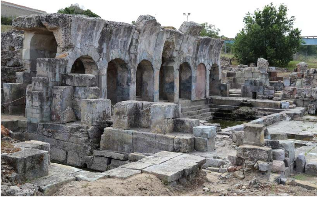
Fig. 3 - The nucleus of Baths I: the natatio with the Nymphaeum in the foreground (photo by Unicity S.p.A.).