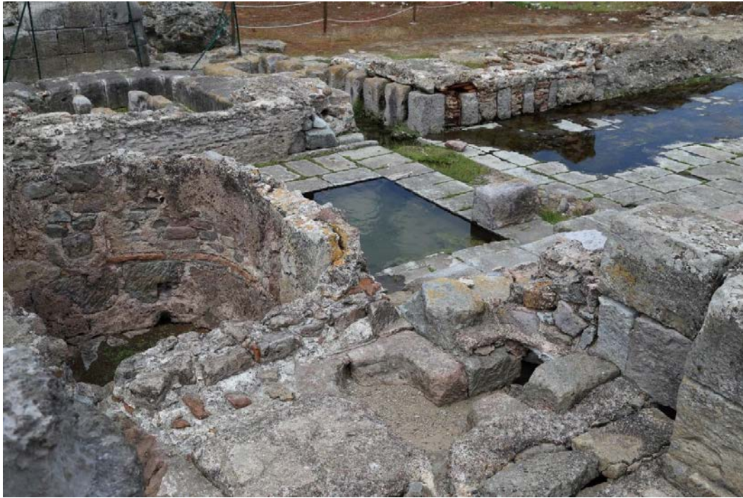
Fig. 5 - The service areas of Baths I

On its north and south side the pool had porticoed corridors, while on the western one it had cisterns and service areas (fig. 5).