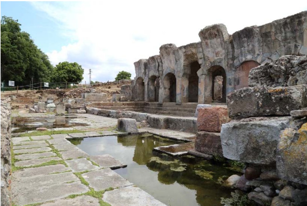
Fig. 4 - The natatio seen from the northern service environments (photo by Unicity S.p.A.).